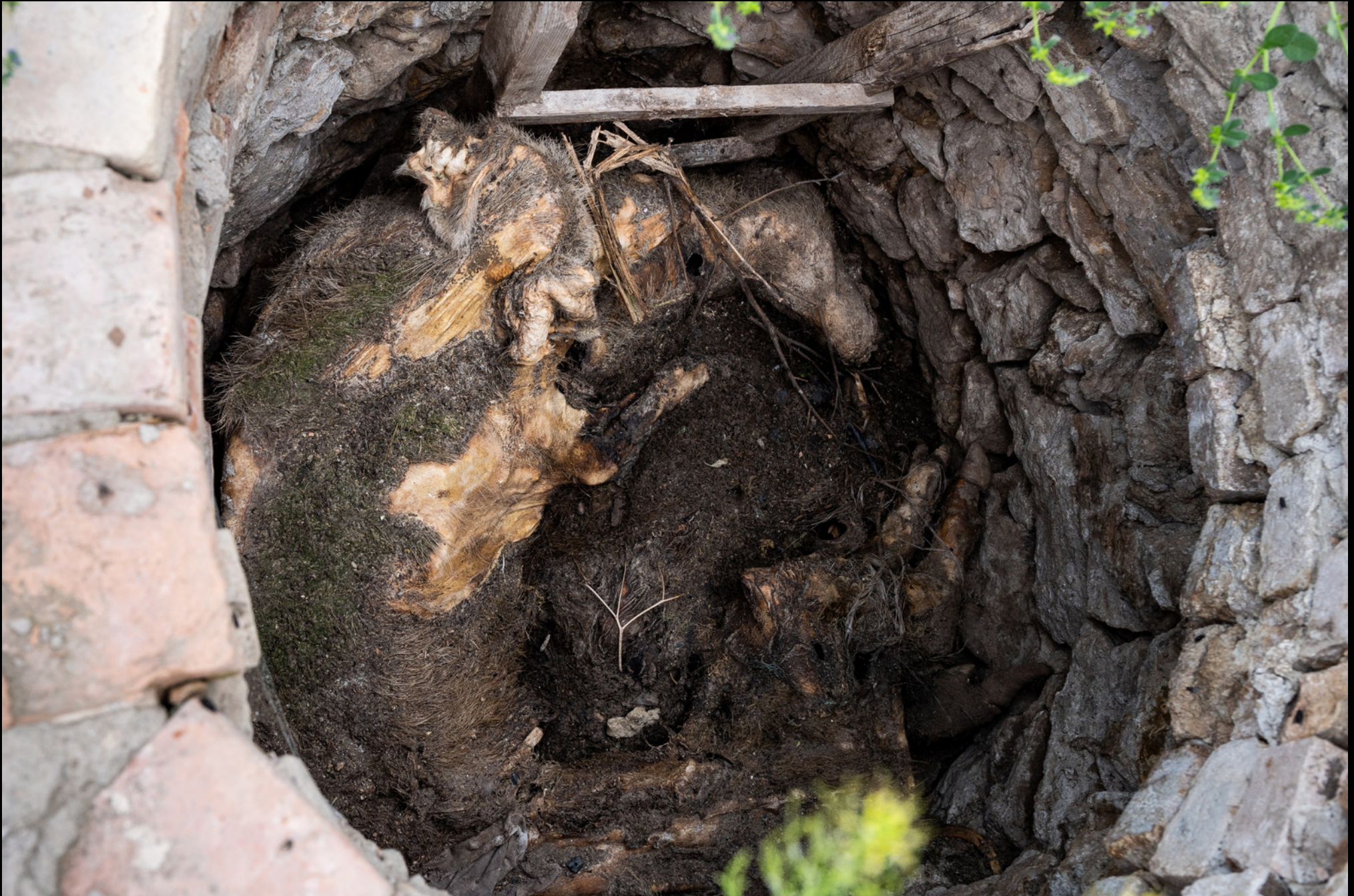
Velyka Oleksandrivka - Two pigs in a well.