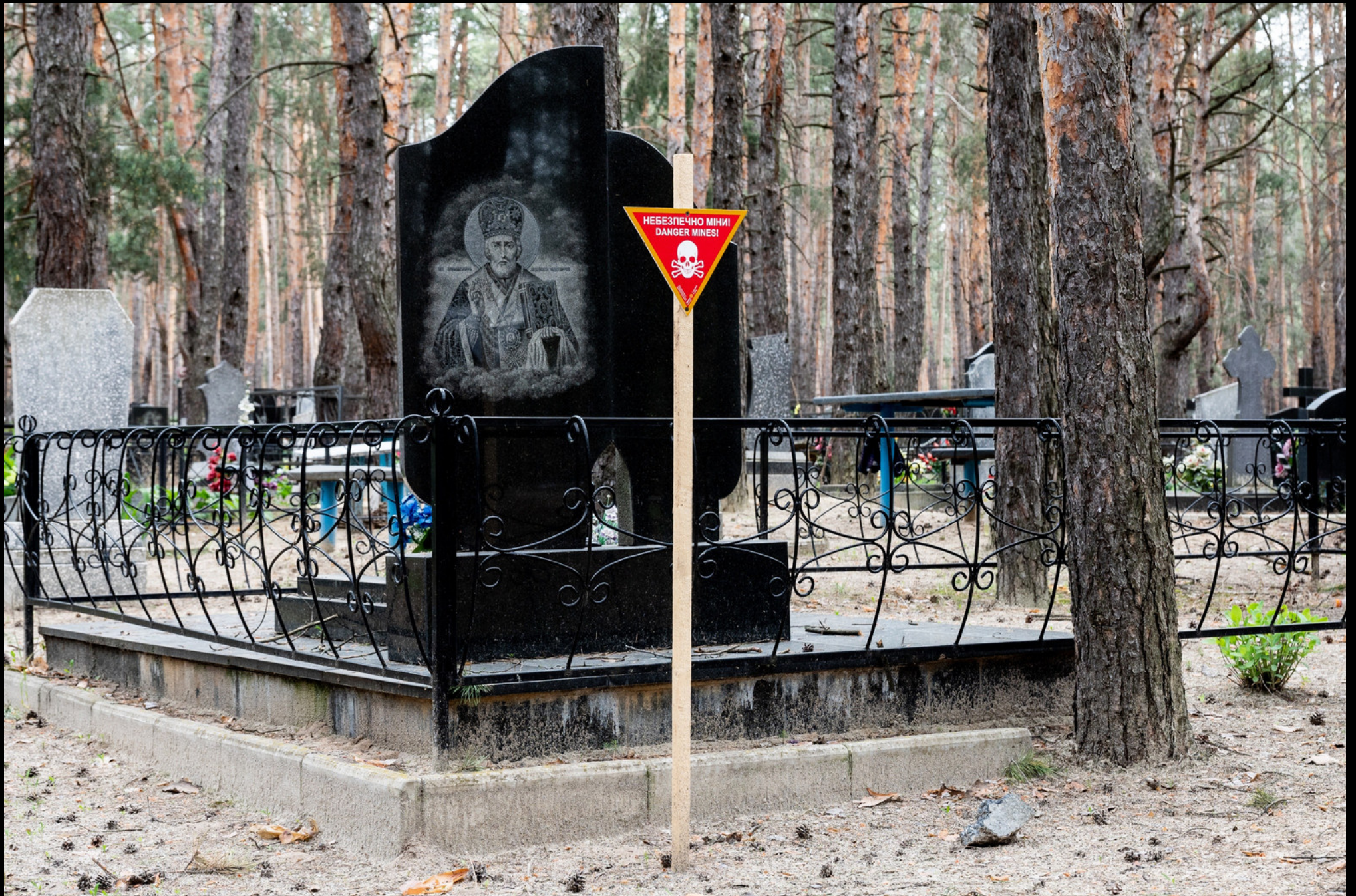
Kupiansk - A warning sign indicating that there are landmines in the cemetery.