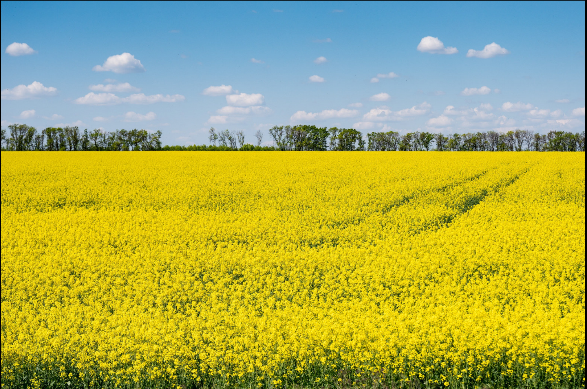
Kharkiv Oblast - One of many mustard seed fields that can be seen in travels around Ukraine.