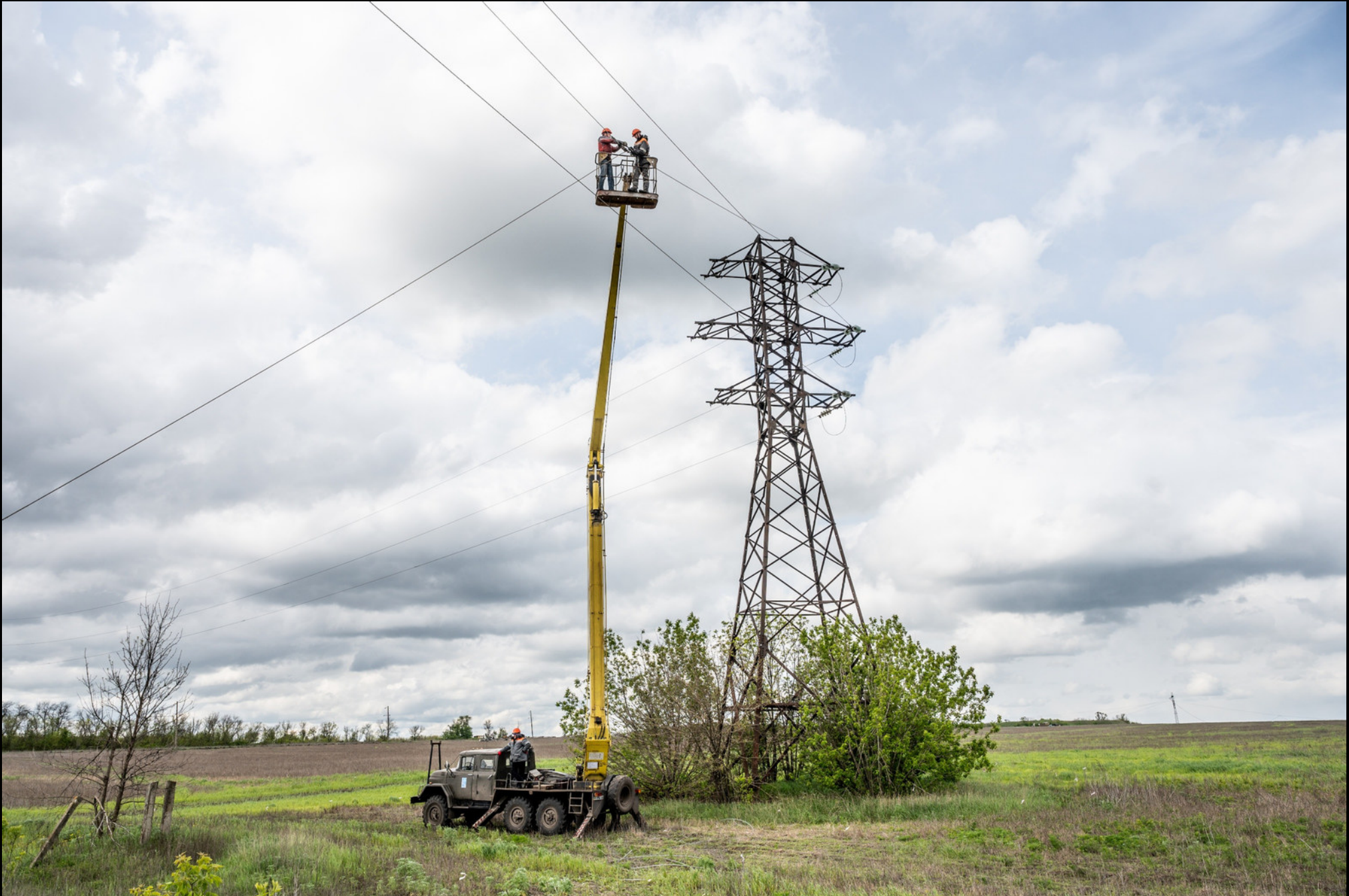
Kam'yanka - Many electrical lines need to be repaired because of attacks by Russian forces.