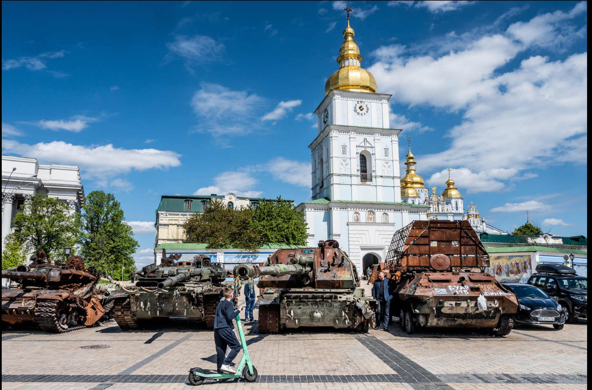
Kyiv - Destroyed Russian tanks and other military vehicles on display in front of St. Michael's.