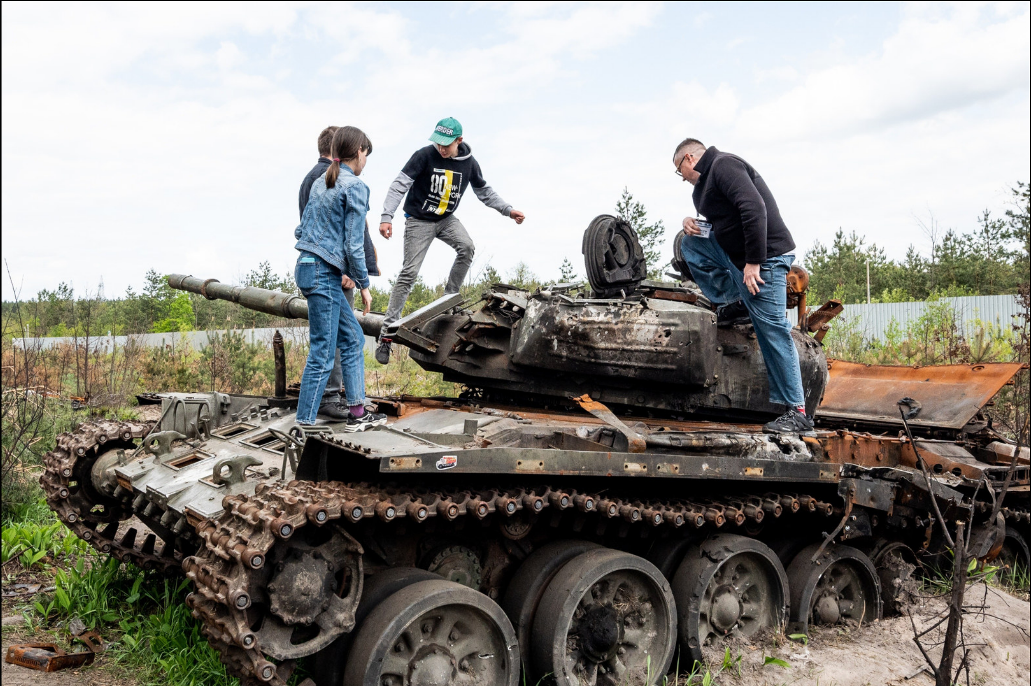
Nalyvaikivka - Destroyed Russian tank by the side of the road being examined by Ukrainian civilians.