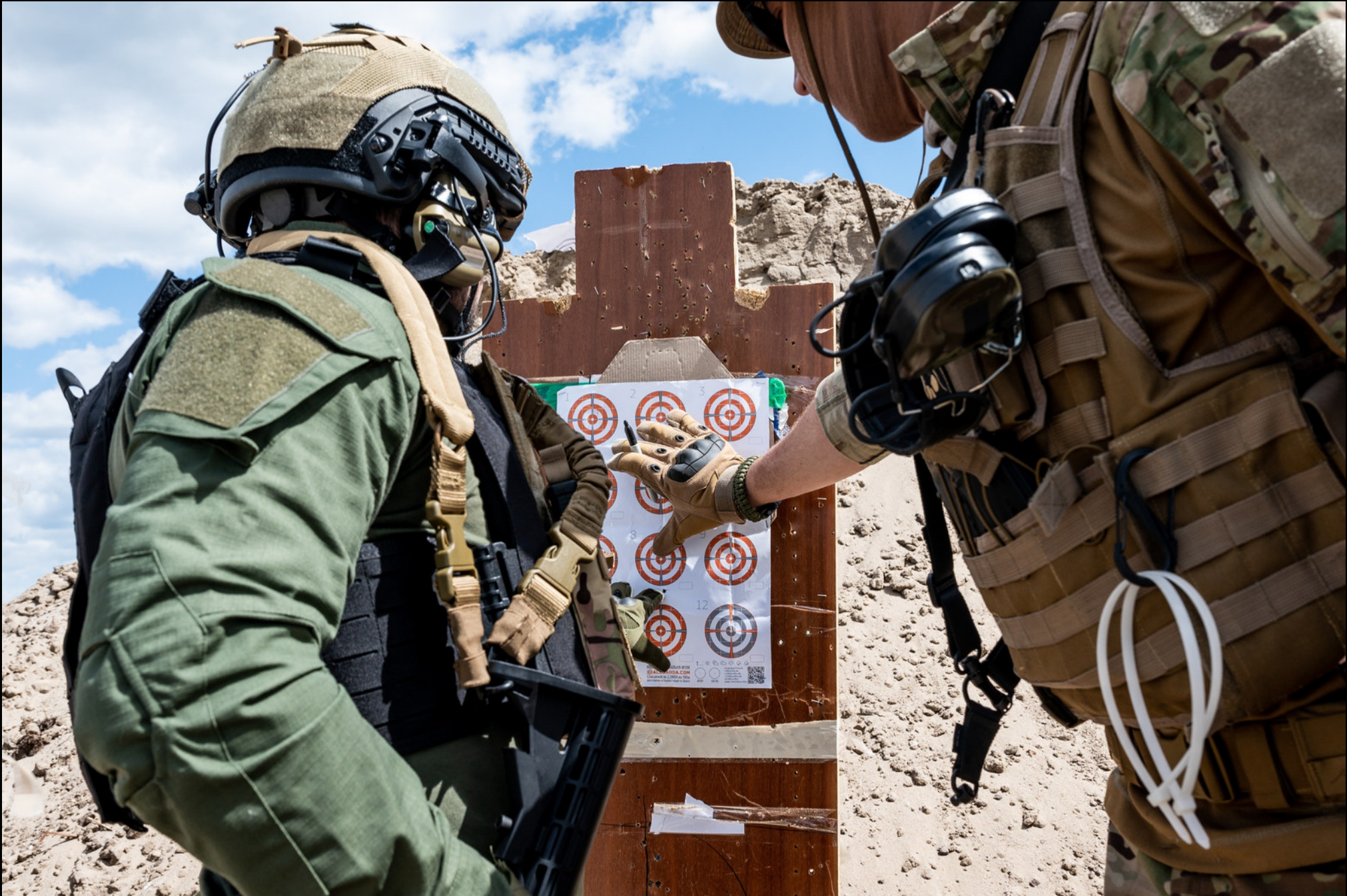
Kyiv - Target Practice.