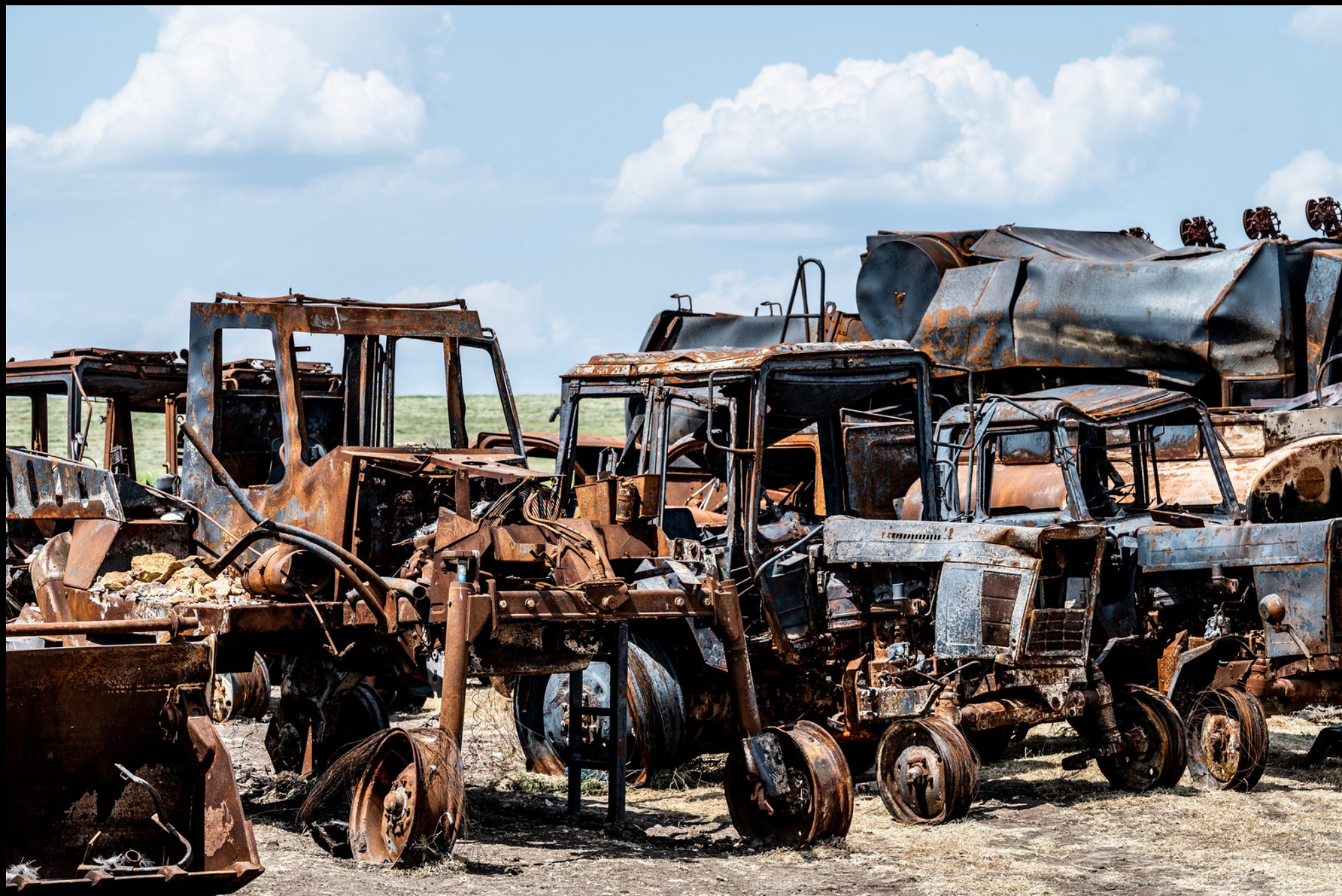
Velyka Oleksandrivka - Just a few of the many destroyed farm vehicles.