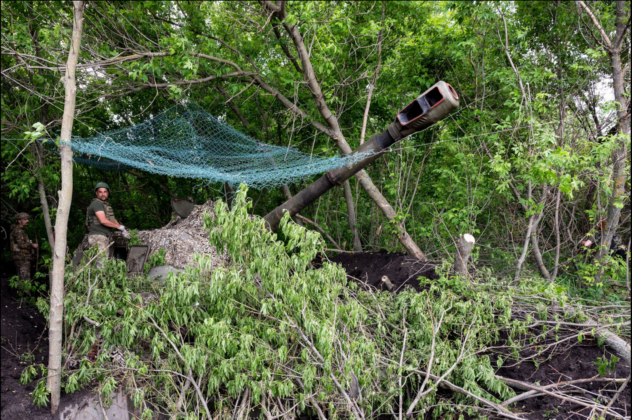
Donetsk Oblast (exact location not disclosed) - Waiting to fire the well camouflaged howitzer.