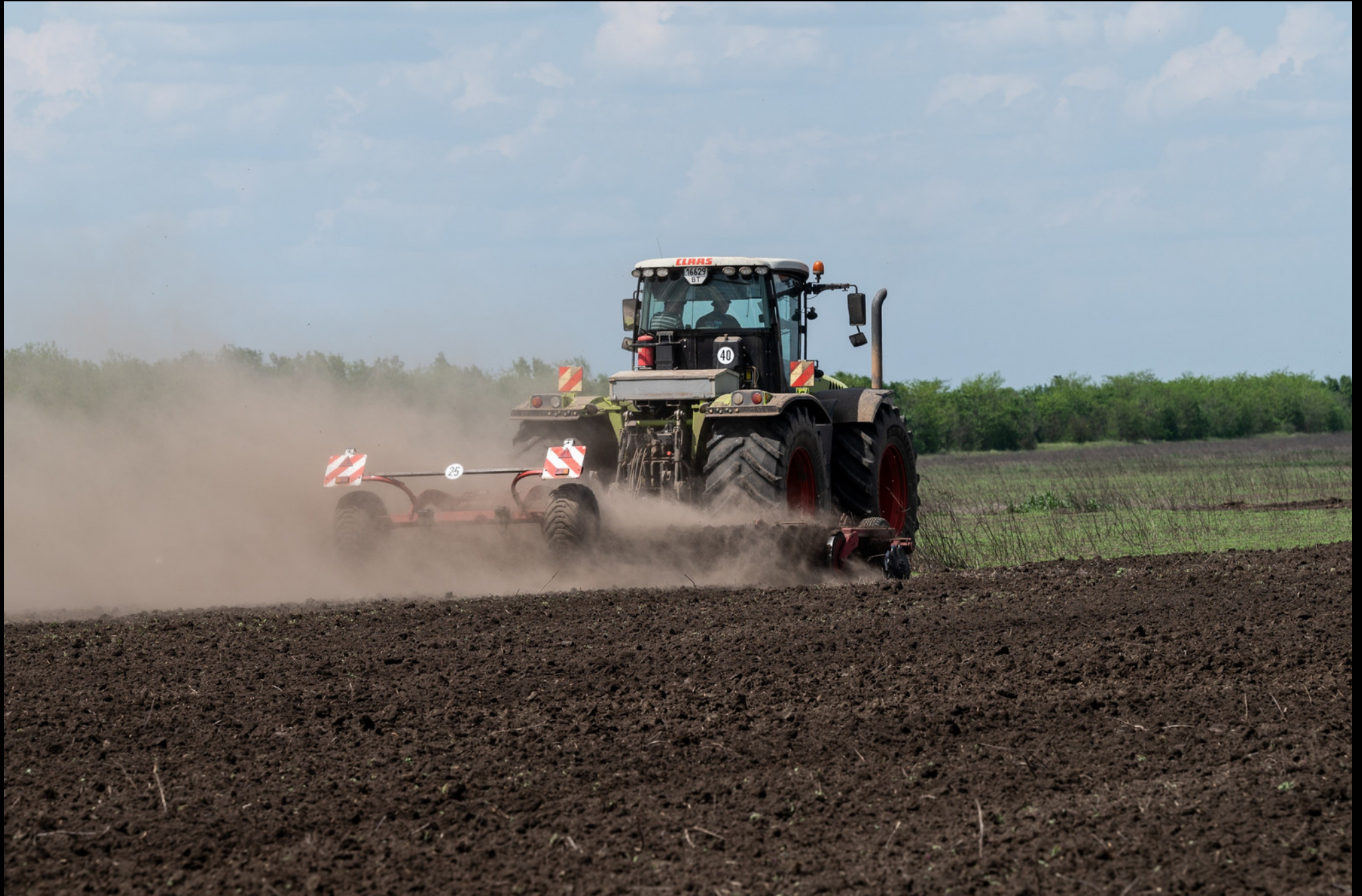
Velyka Oleksandrivka - Some fields were demined after Ukrainian forces liberated the farm and through loans of new equipment by NGO's the farmer was able to start planting again. Other fields of the farm had not been demined and can not be used safely until they are.