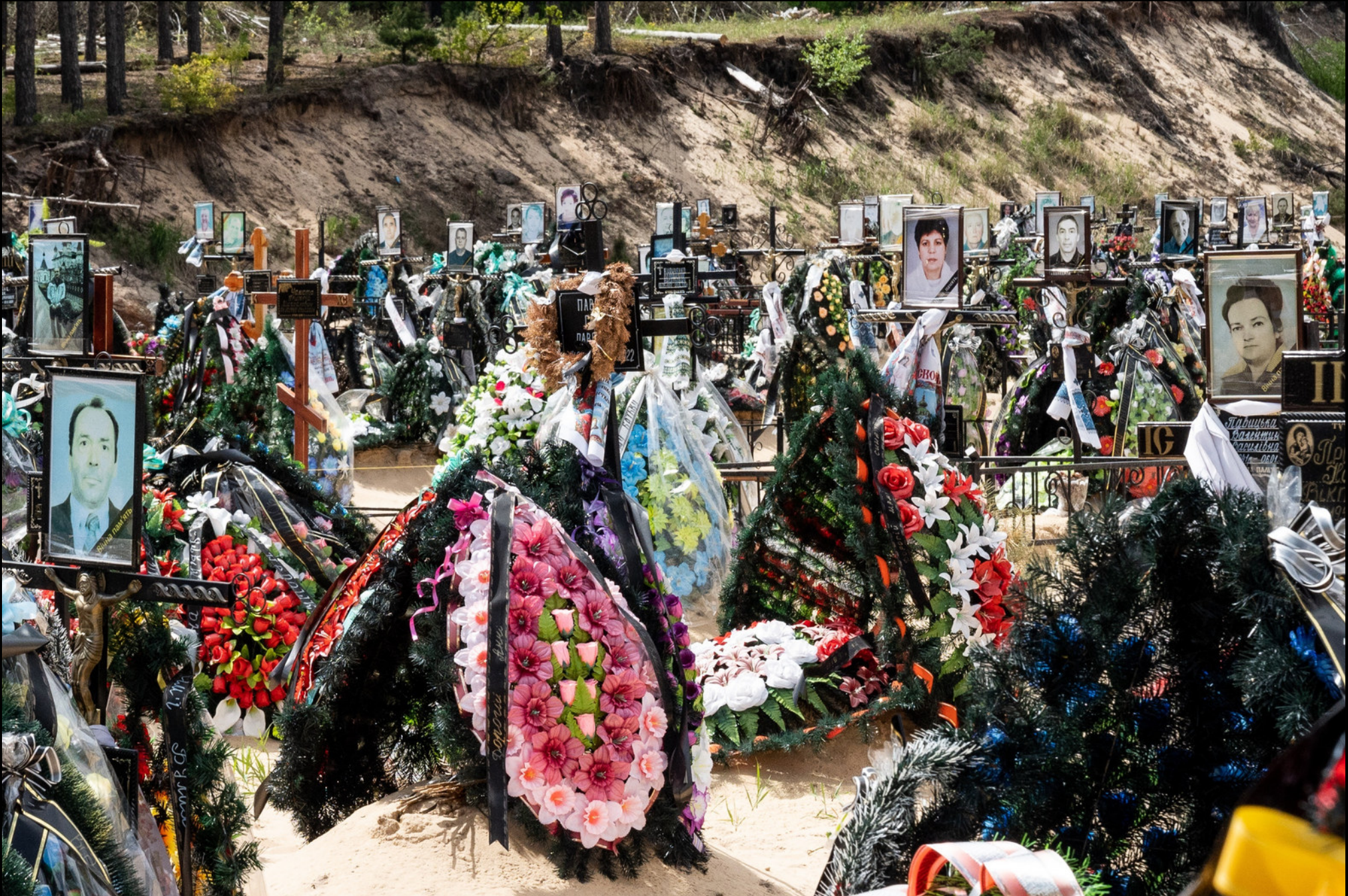
Irpin - Victims of the 2022 massacre in nearby Bucha war are buried here.