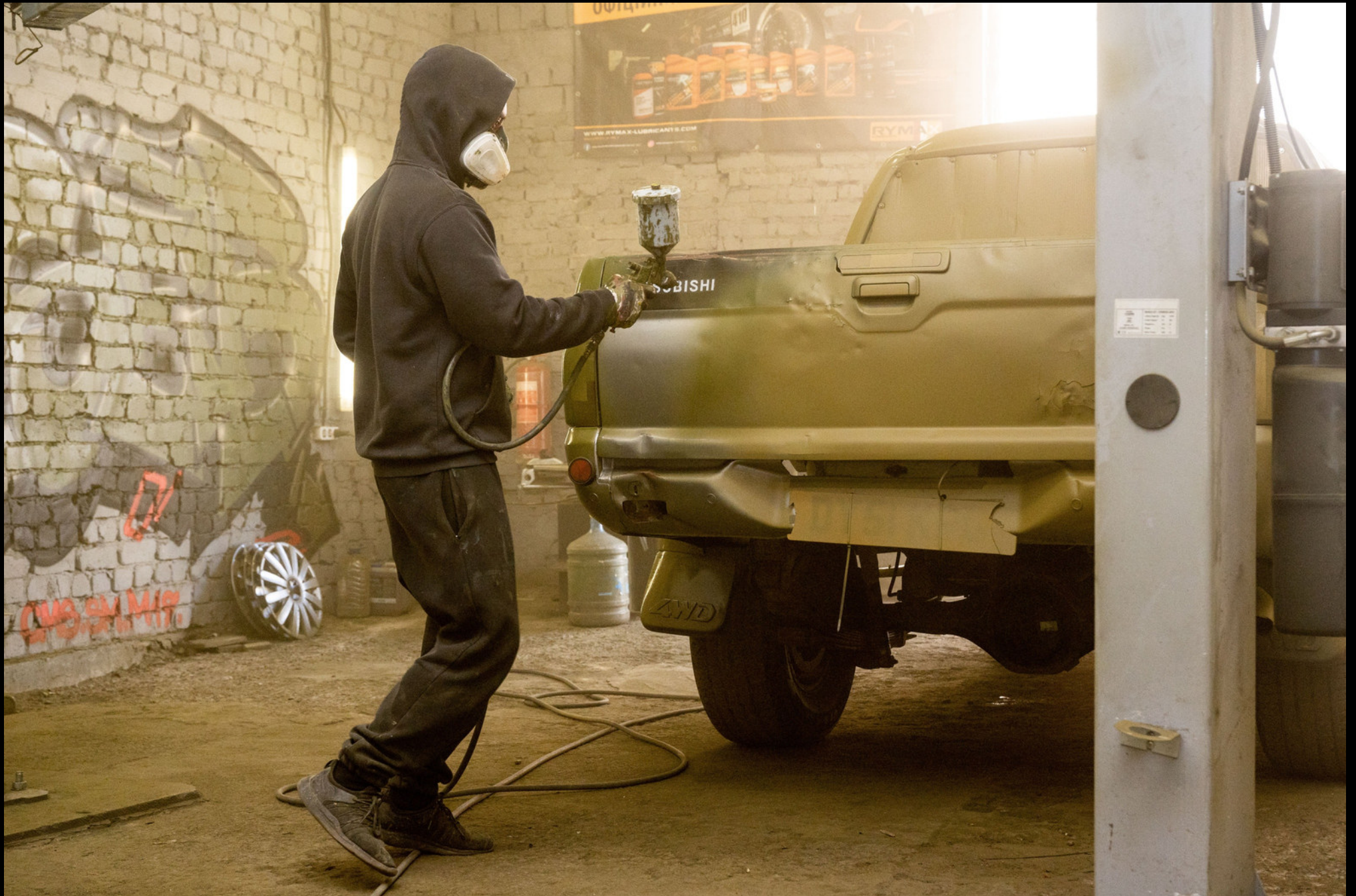
Kyiv - Painting a vehicle.