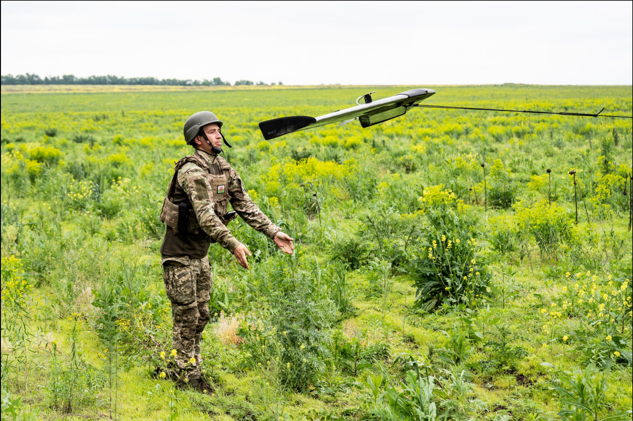
Donetsk Oblast (about 6 km from the front, exact location not disclosed) - The Ukrainian made Valkyrja drone is launched by a slingshot.