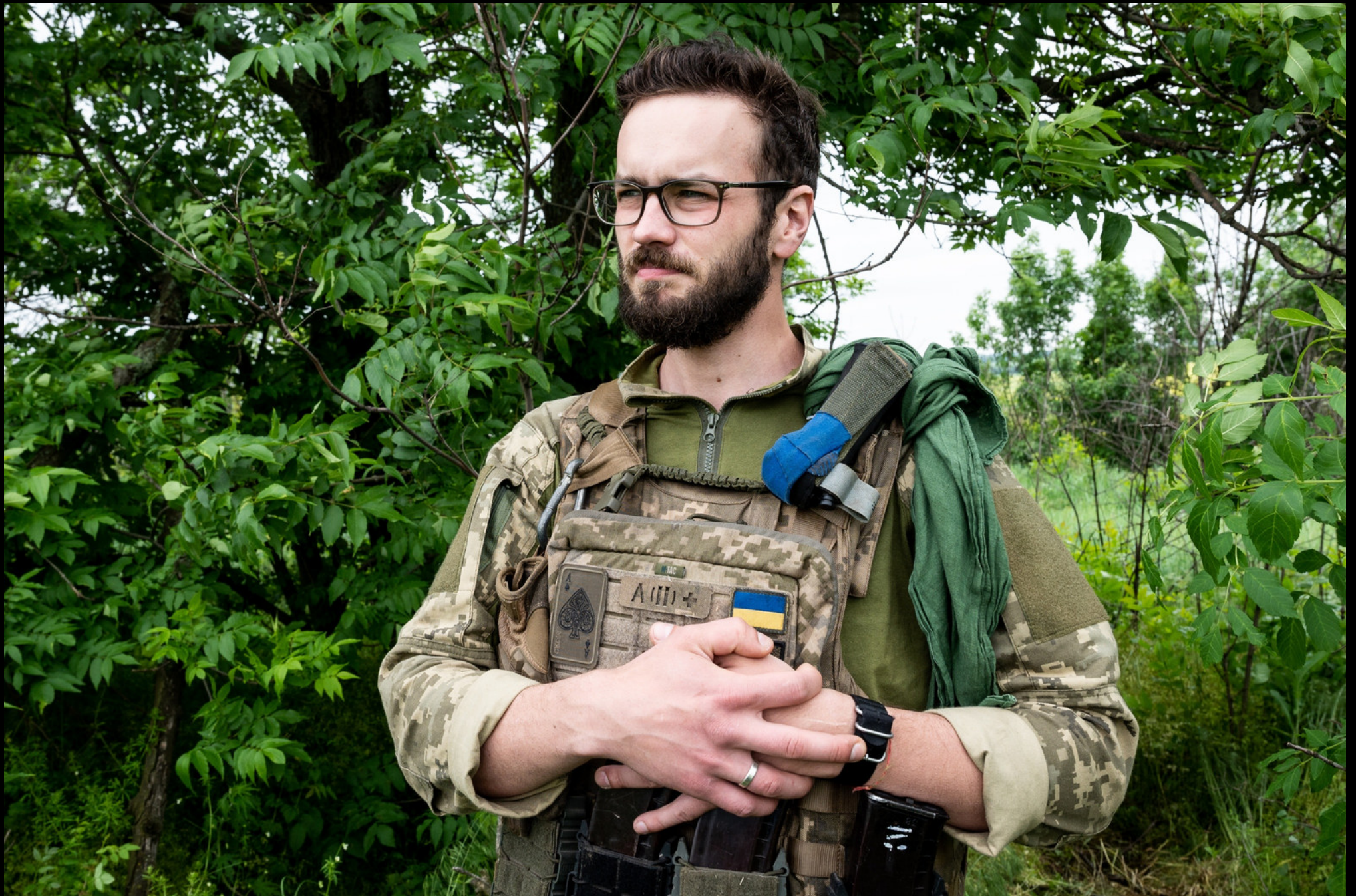
Donetsk Oblast (about 6 km from the front, exact location not disclosed) - Our escort to visit the drone unit.