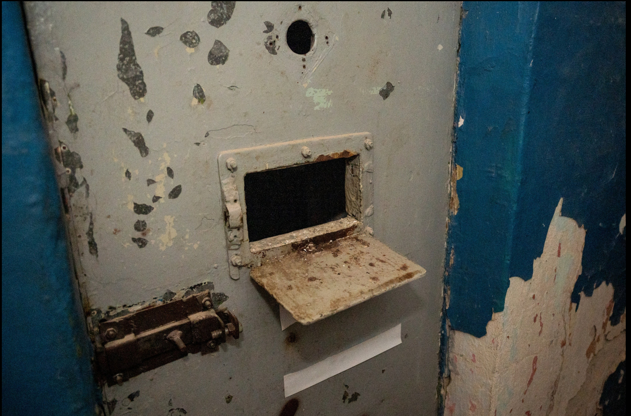
Kherson - The door to a prison cell used by Russians when they occupied Kherson.