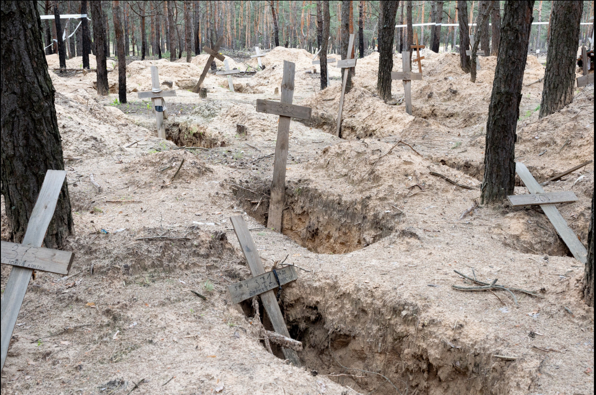
Kupiansk - A temporary cemetery used when the war prevented use of the regular cemetery.