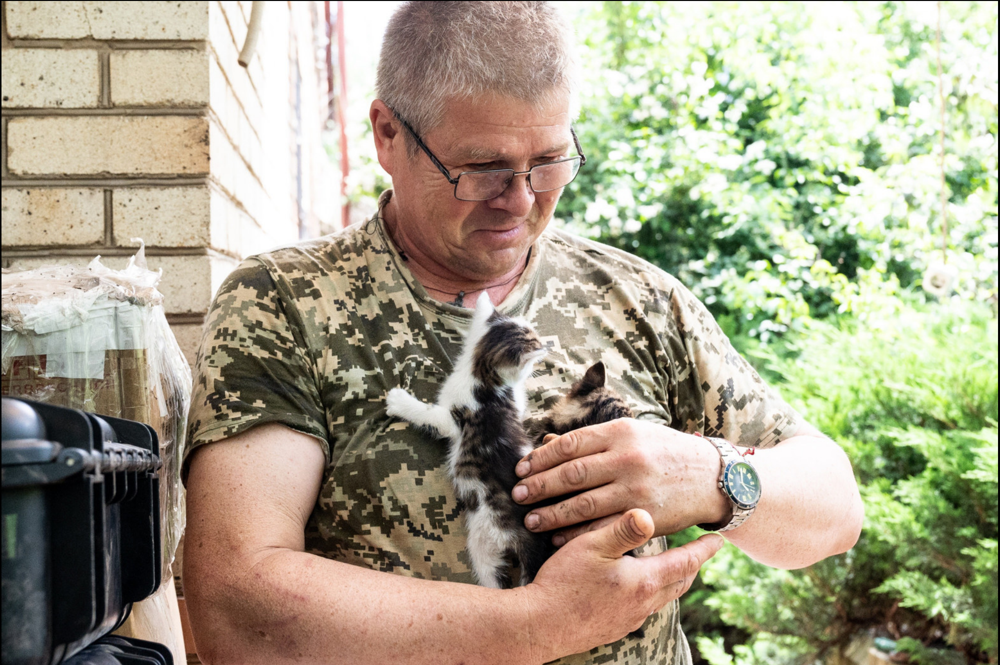
Donetsk Oblast (exact location not disclosed) - A soldier playing with kittens outside a small unmarked building serving as the headquarters for unit responsible for a 82mm mortar.