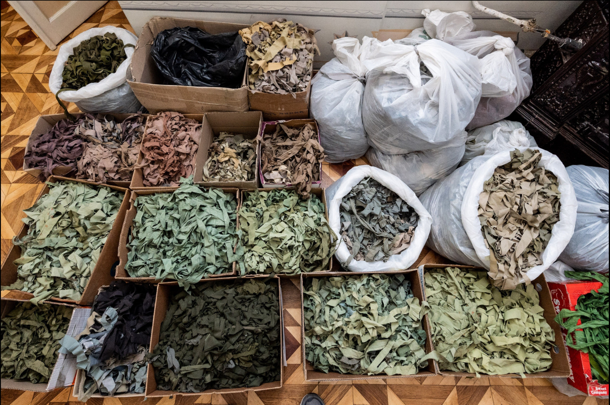
Lviv - Volunteers use these strips of cloth to make camouflage nets for the military.