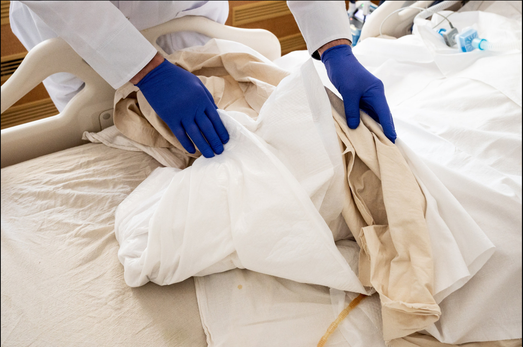
Dnipro - In a ward of soldiers with amputated limbs, this soldier lost his right leg.