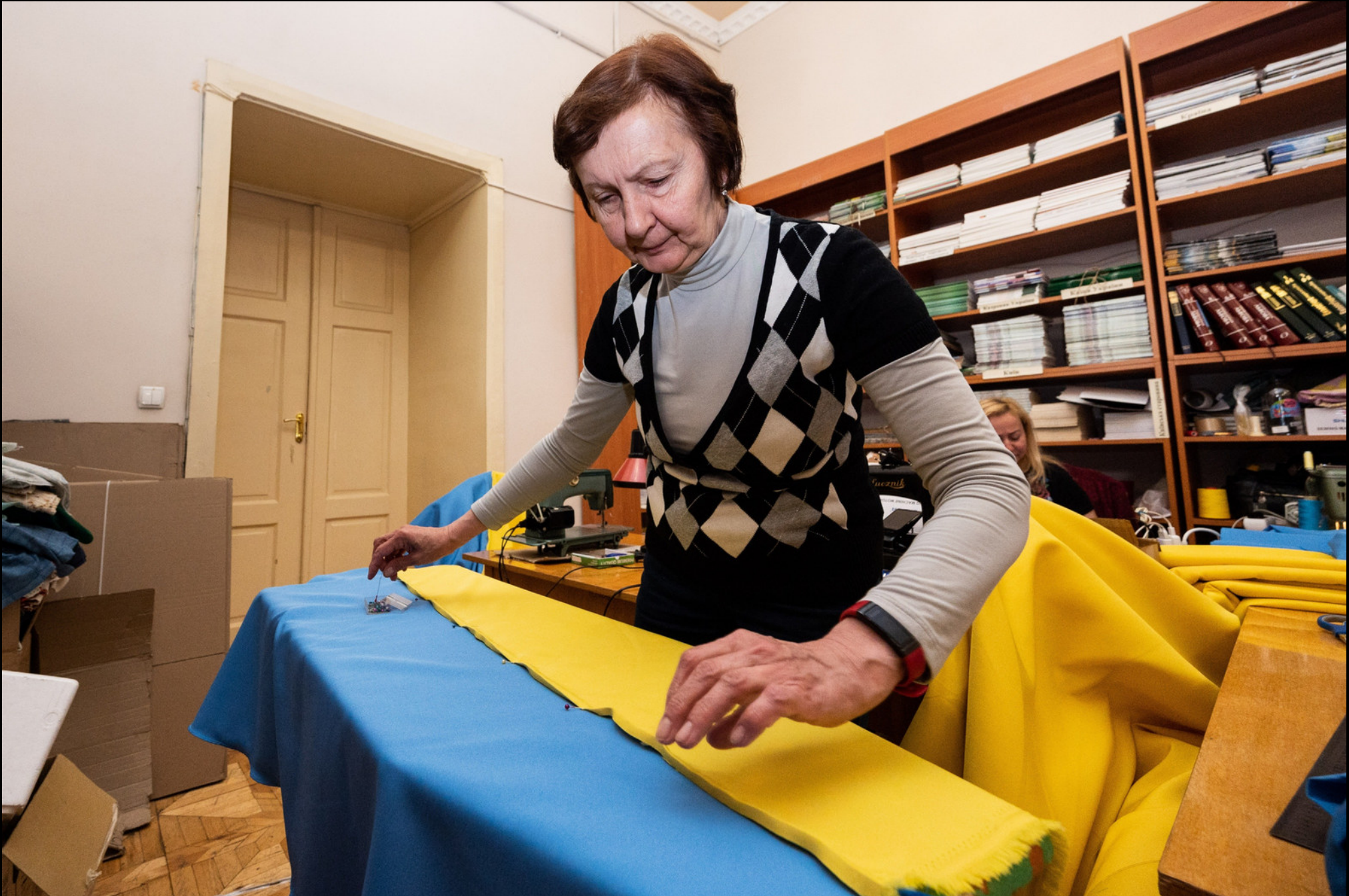
Lviv - Making huge Ukrainian flags in a spare room in a library.