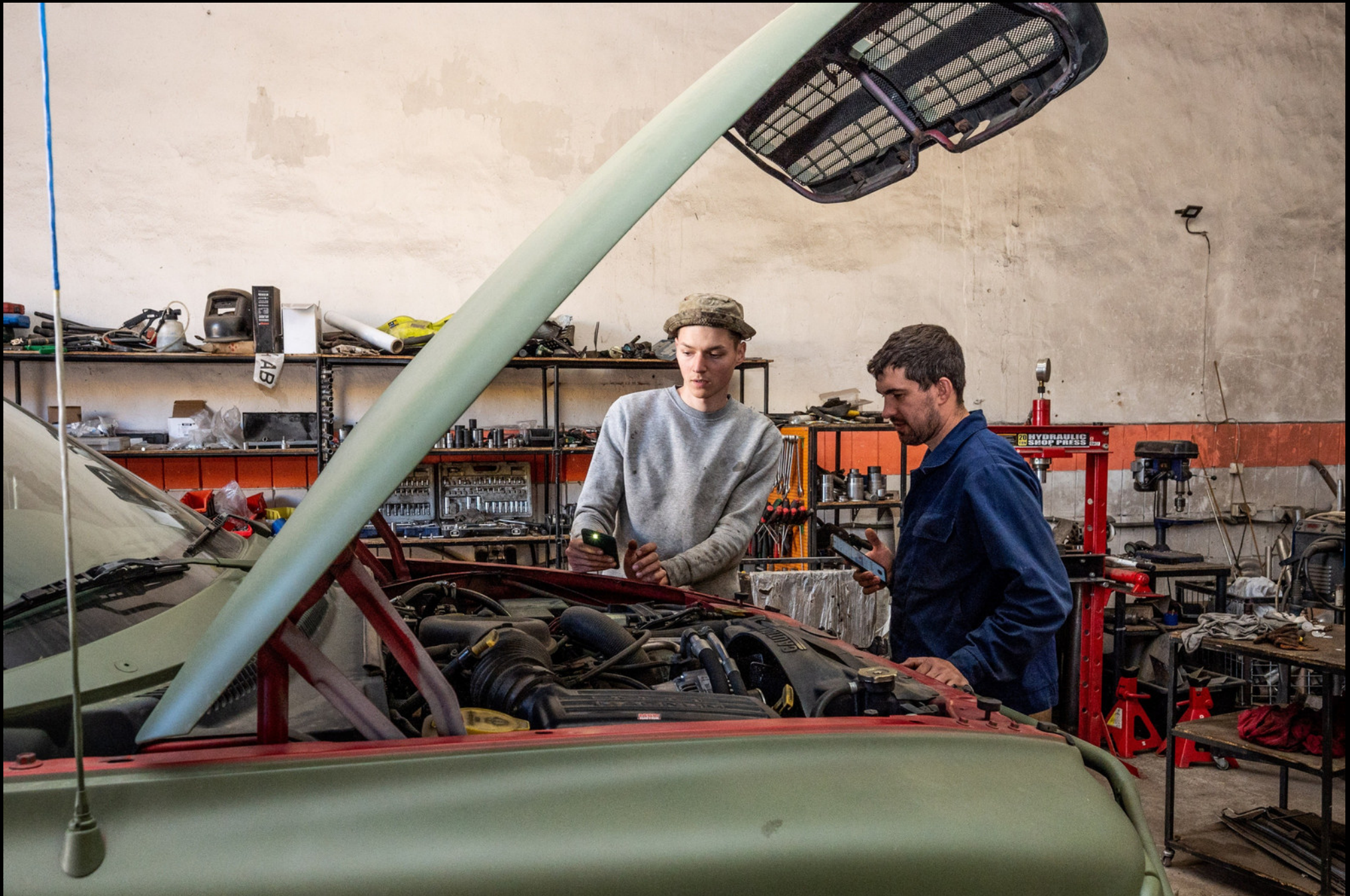
Kyiv - Vehicles are also repaired when necessary.