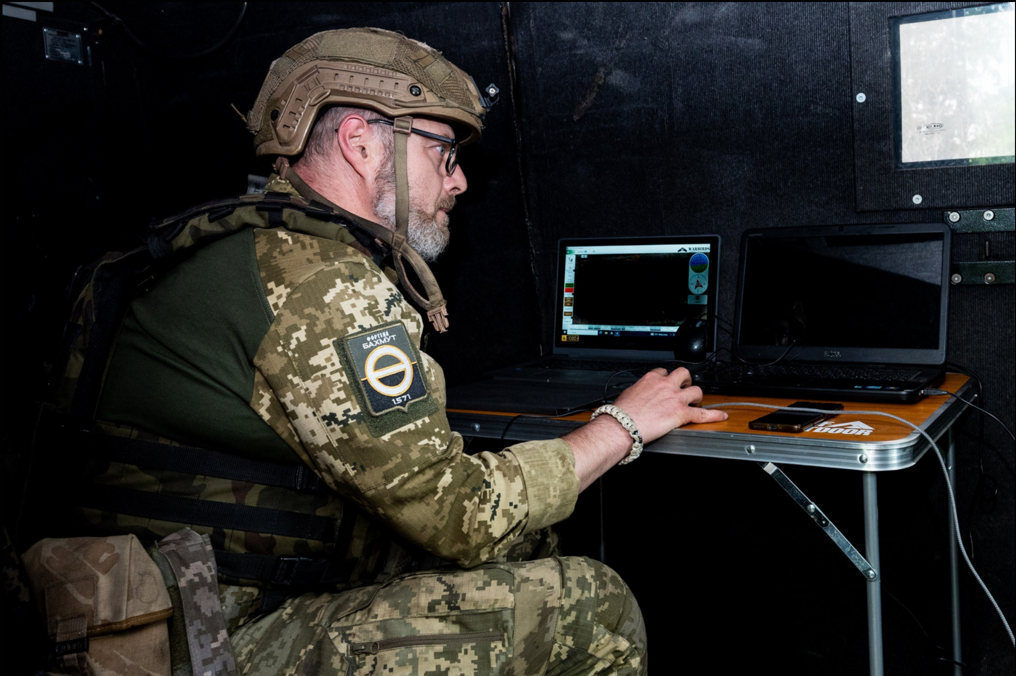
Donetsk Oblast (about 6 km from the front, exact location not disclosed) - In an unmarked and uparmored civilian van a soldier monitors the flight of a reconnaissance drone.