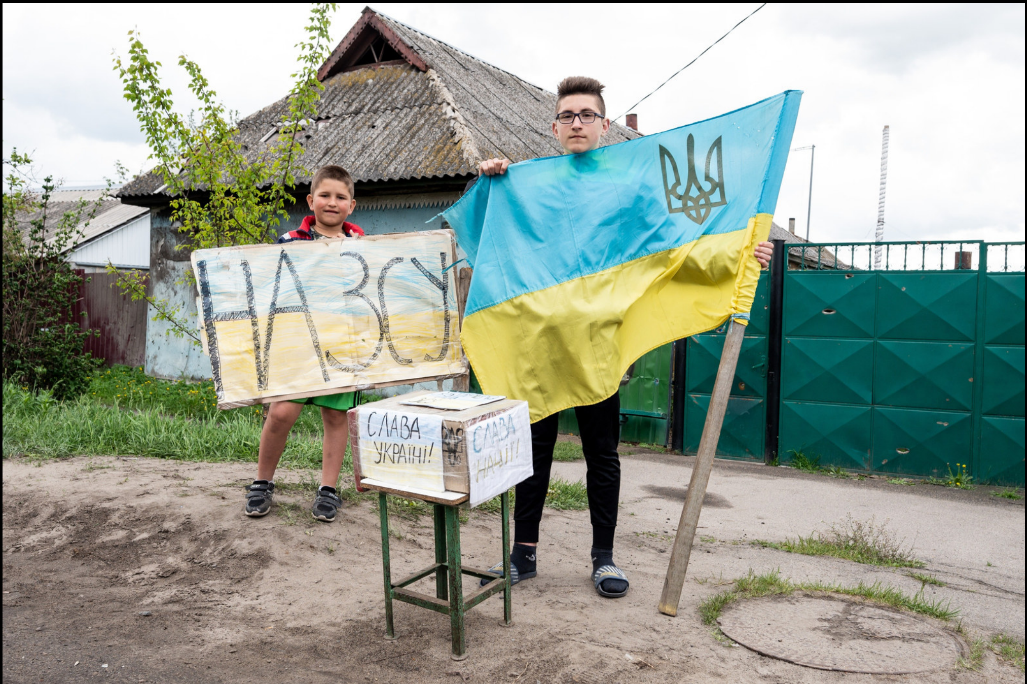
Borodianka - Two boys collecting money for the military.