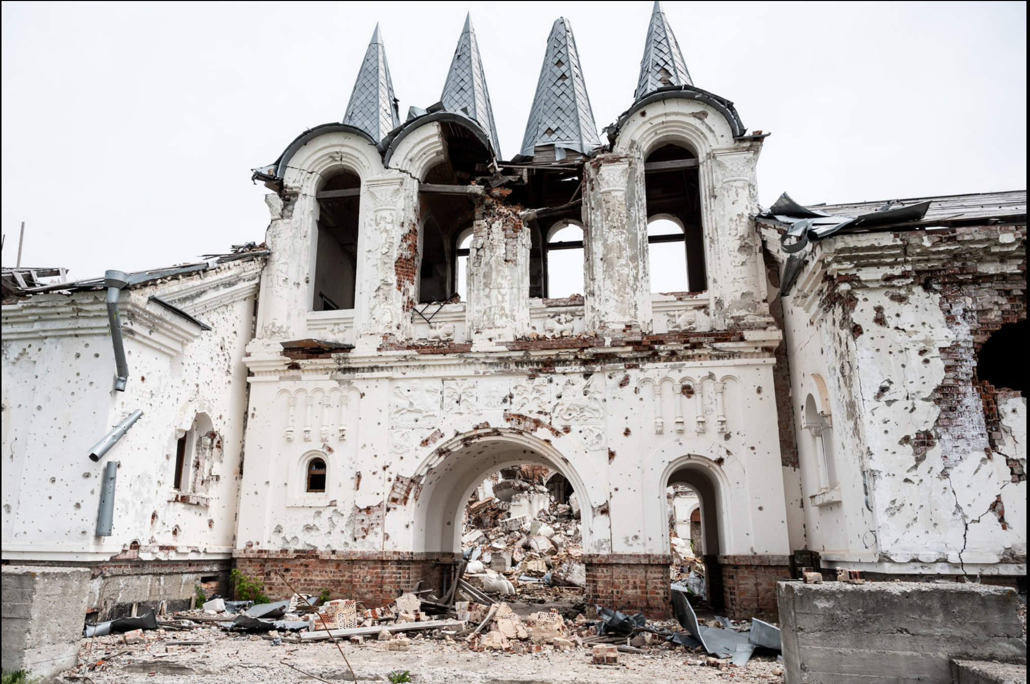
Dolyna - Destroyed monastery.