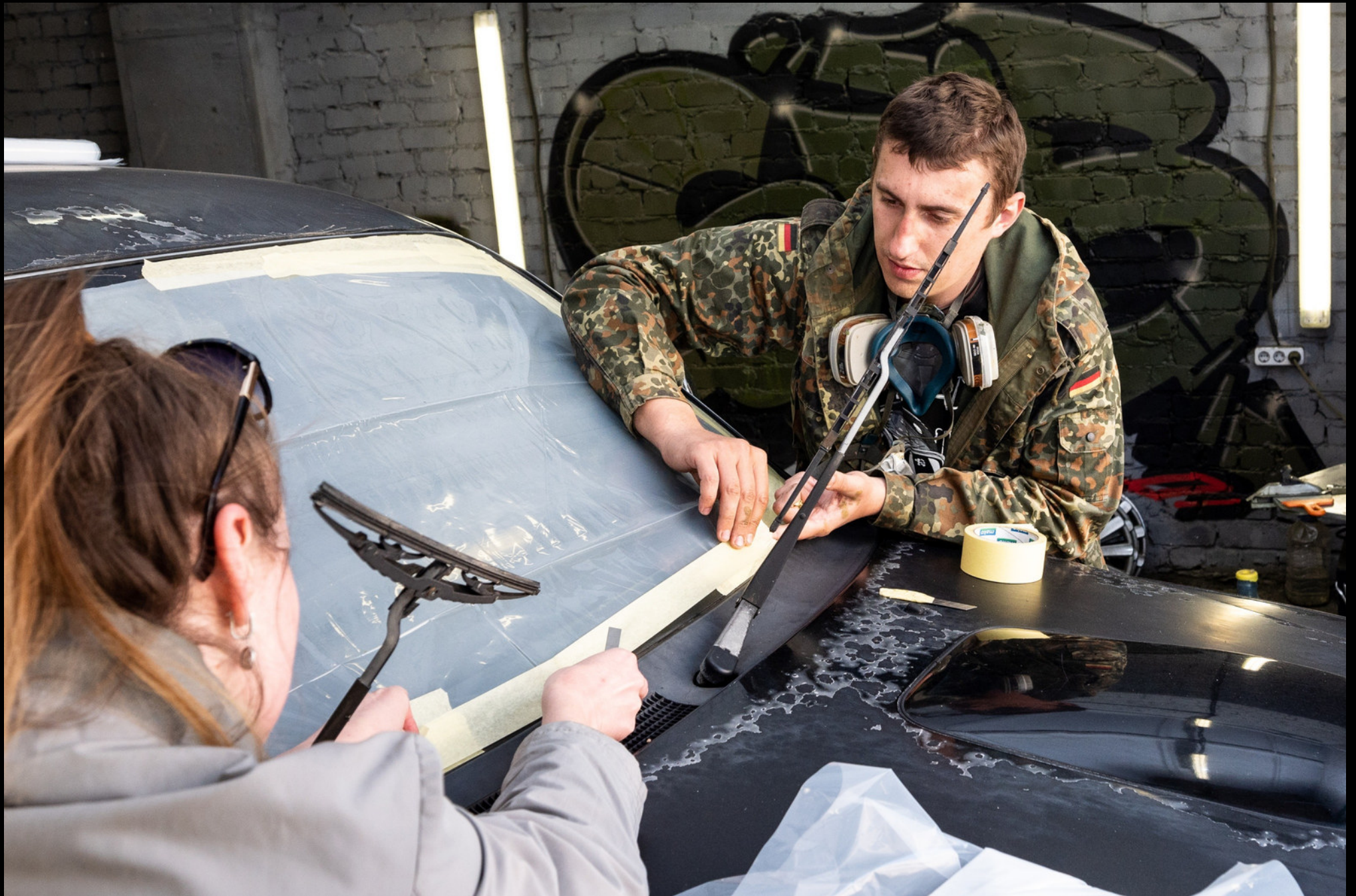
Kyiv - Volunteers and some professionals work at this body shop to prepare these vehicles for use by the military.