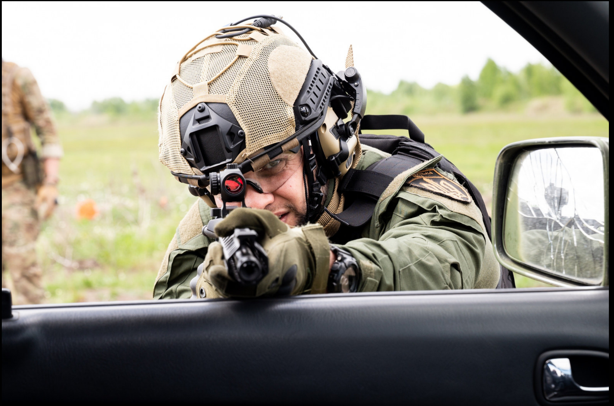
Kyiv - Learning to shoot through a car's window.