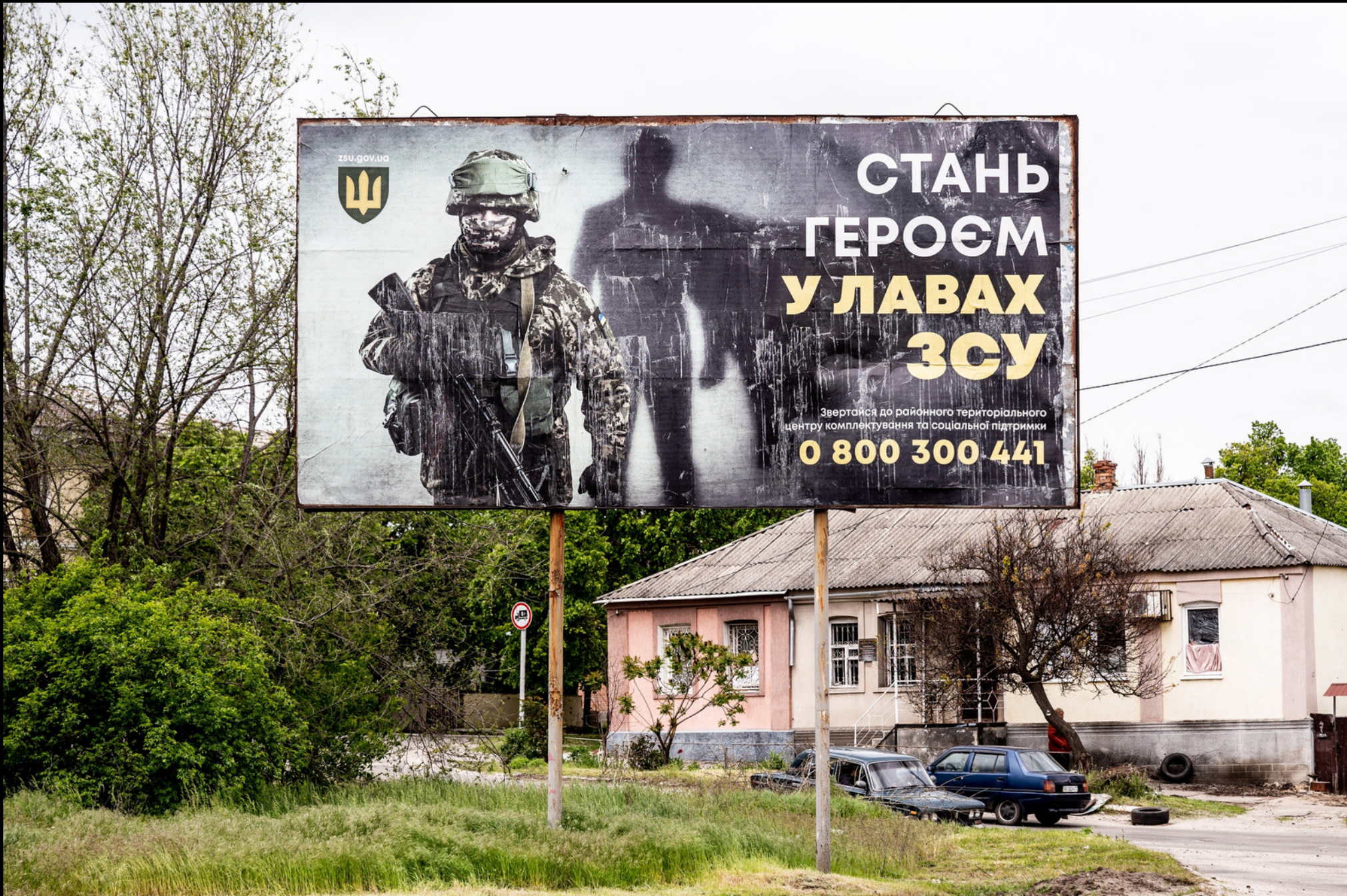
Kupiansk - One of many military recruitment billboards seen in Ukraine.