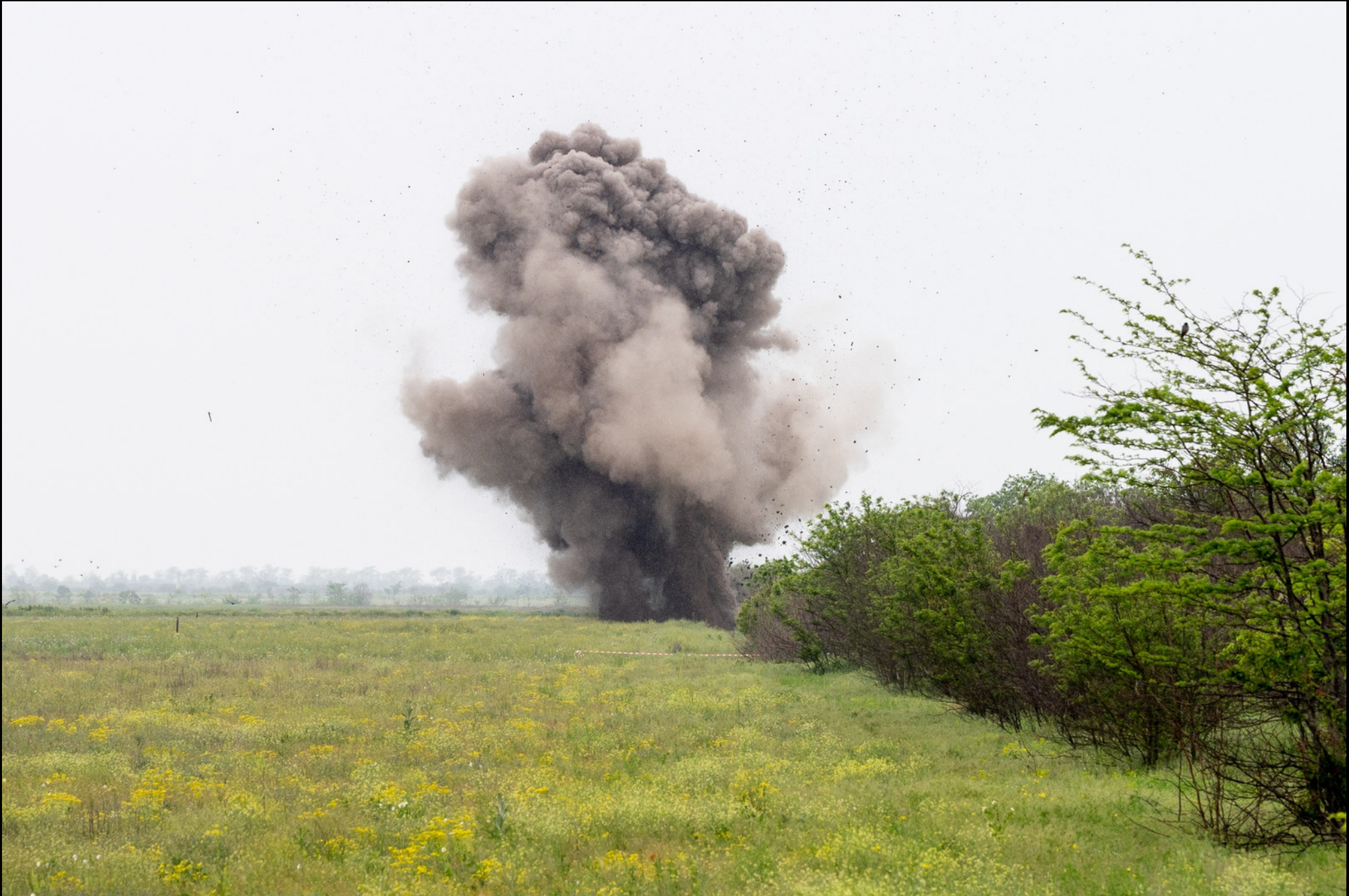
Kherson Oblast (exact location not disclosed) - Boom! The unexploded ordinance that was placed in a pit being destroyed.