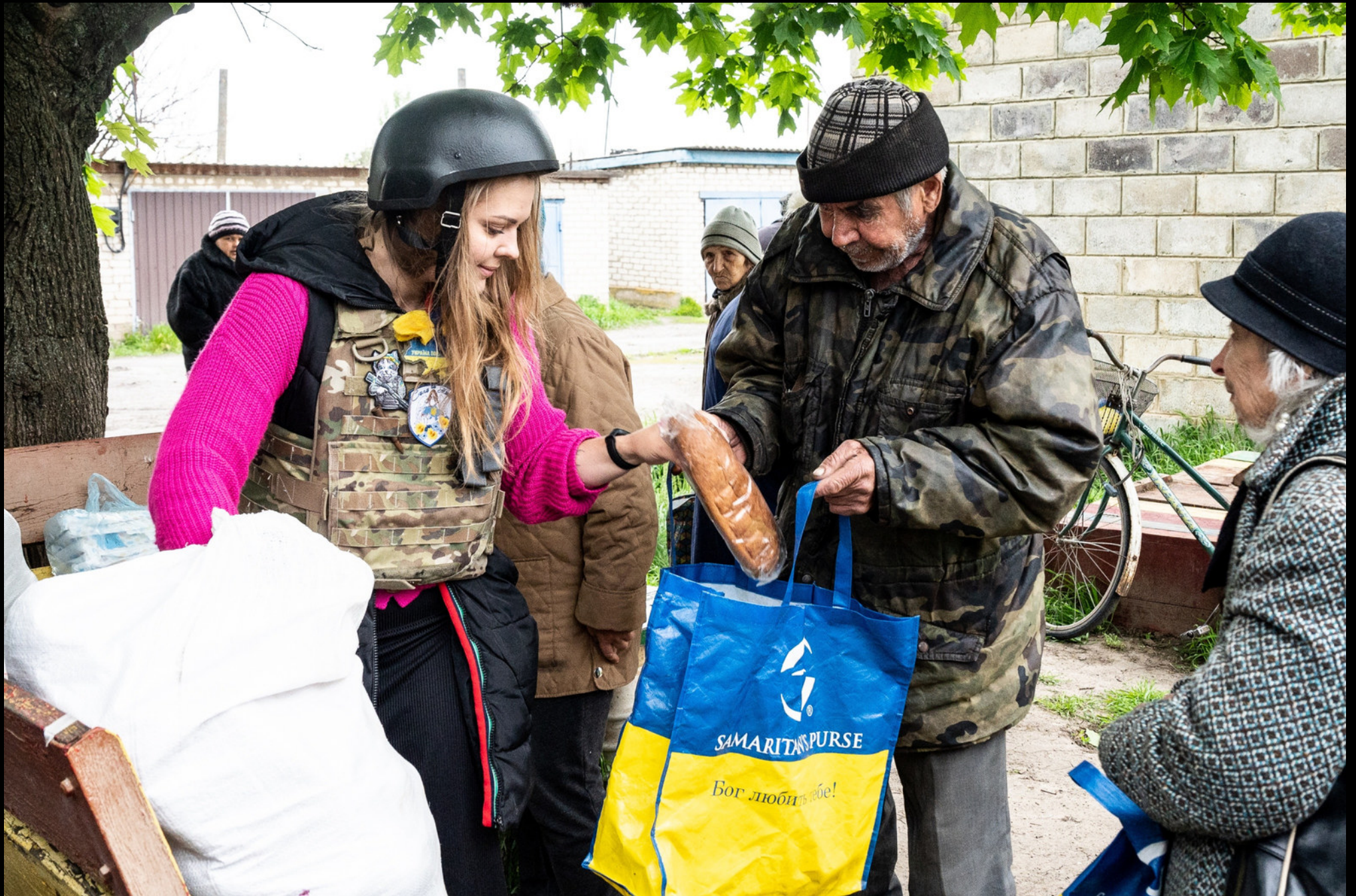
Rozdolne - Delivery of food to a frontline village.