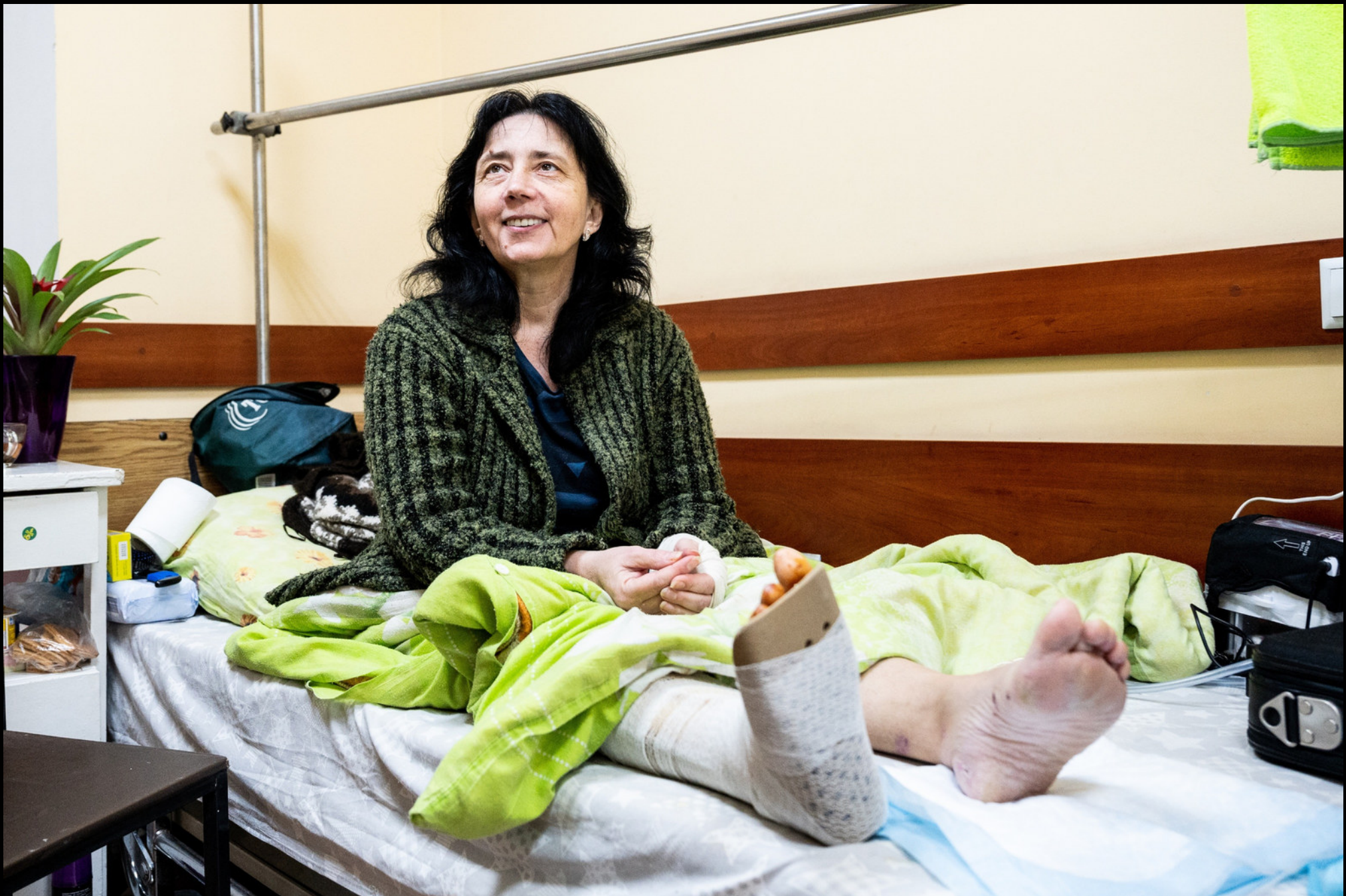
Kupiansk - This woman stepped on a landmine, most likely a small butterfly type landmine. She credits her sneaker with saving her foot.