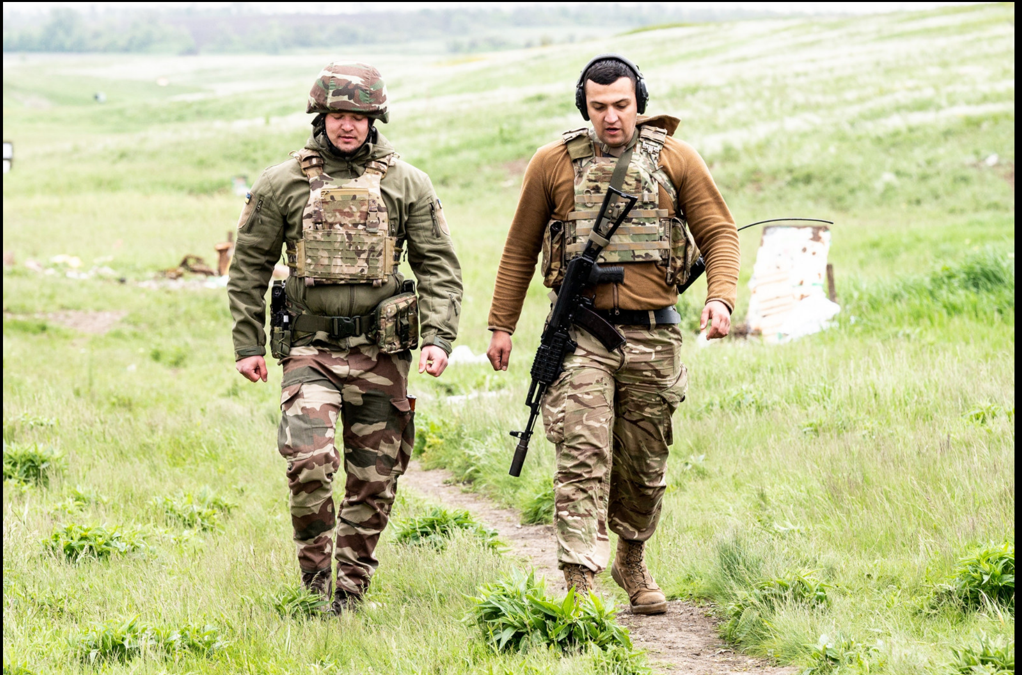
Komar - Two soldiers coming back from checking targets after a round of target practice.