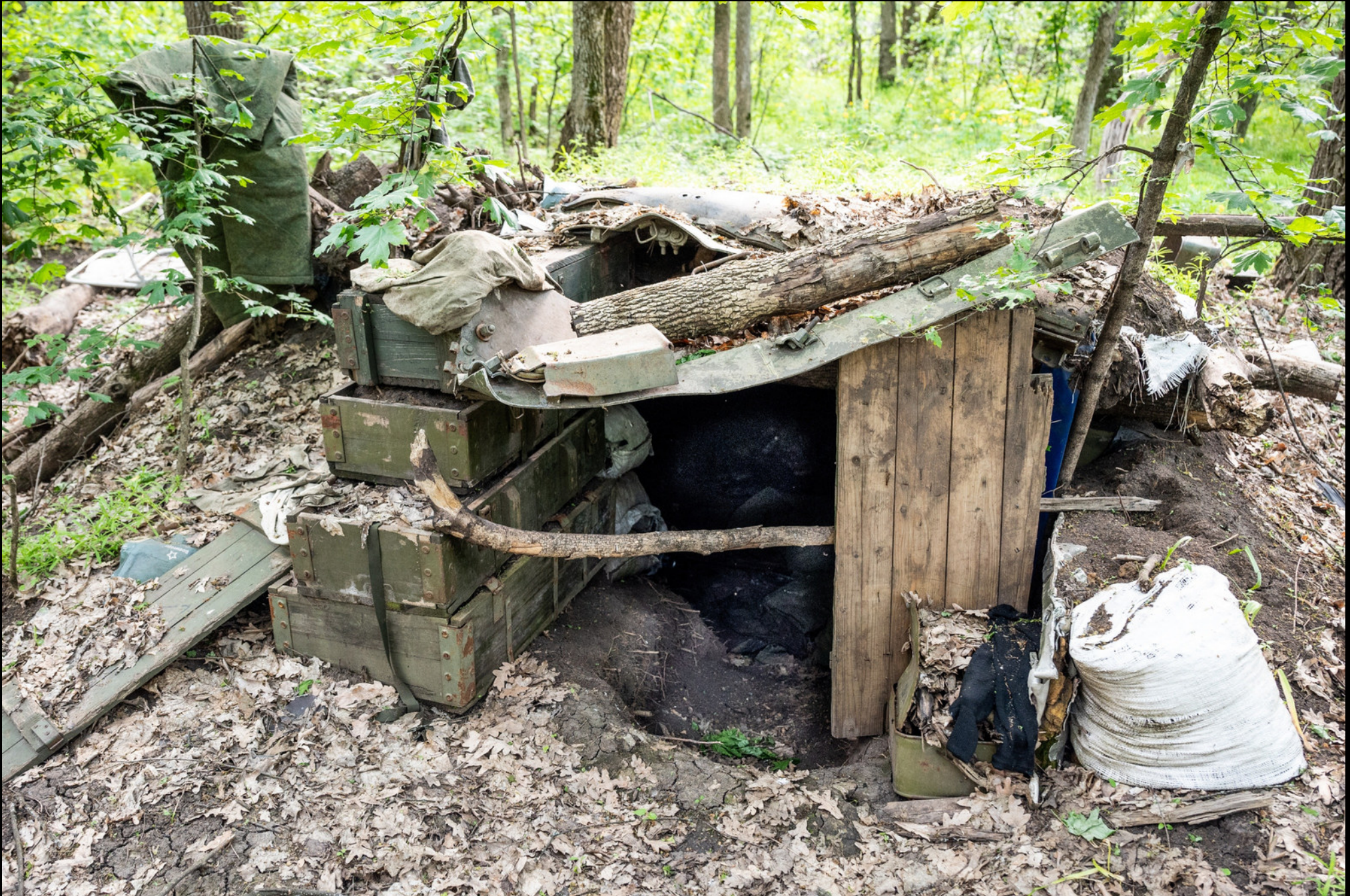
Sulyhivka - Abandoned bunker used by Russian forces when they occupied the area.