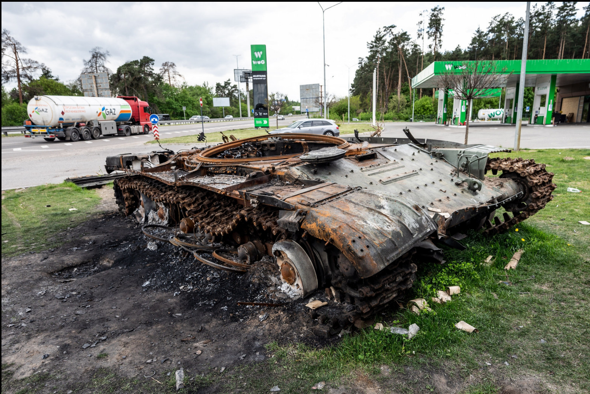
Irpin - Destroyed Russian tank.