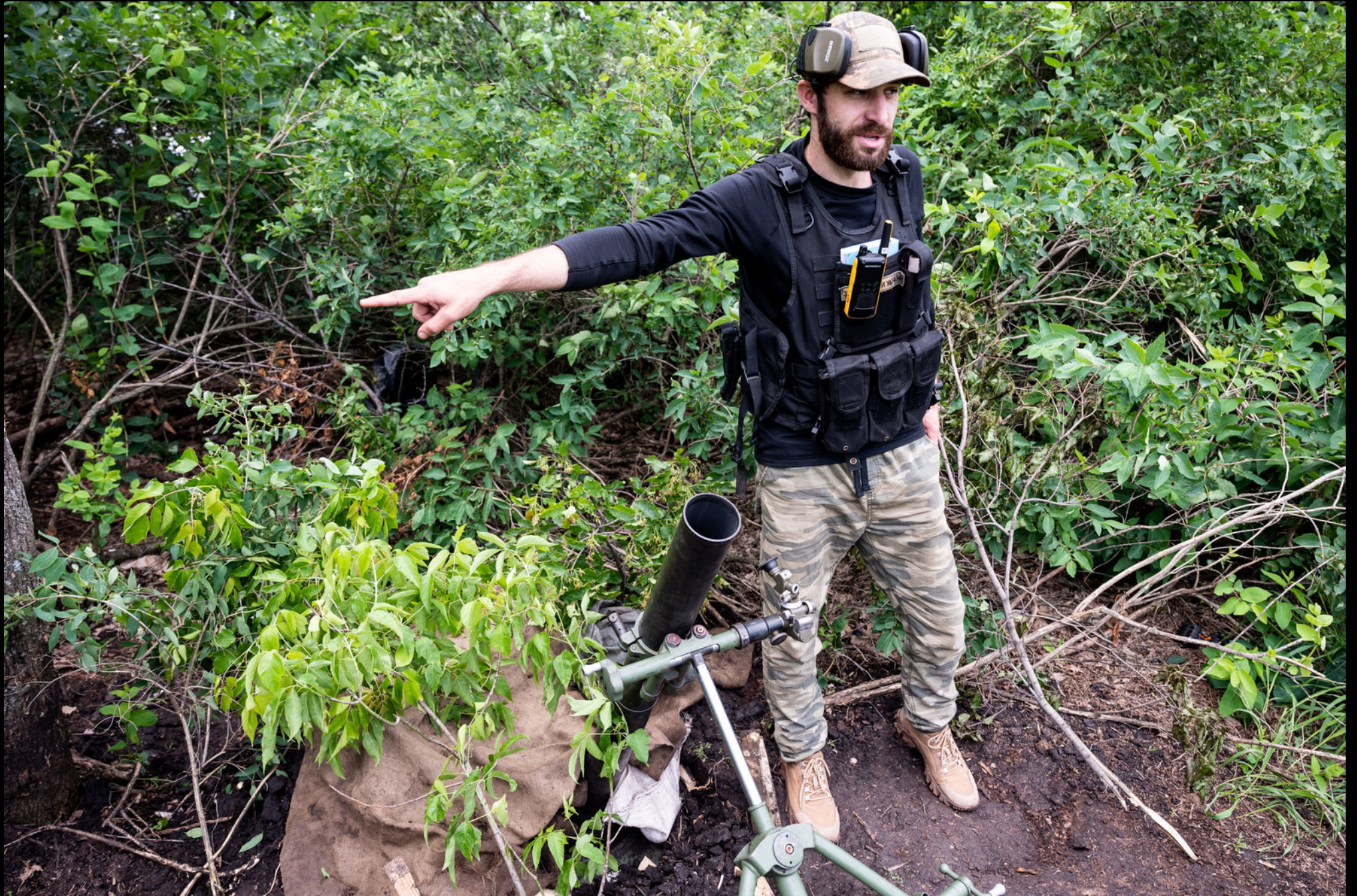
Donetsk Oblast (exact location not disclosed) - The actual 82mm mortar (the round tube facing skyward).