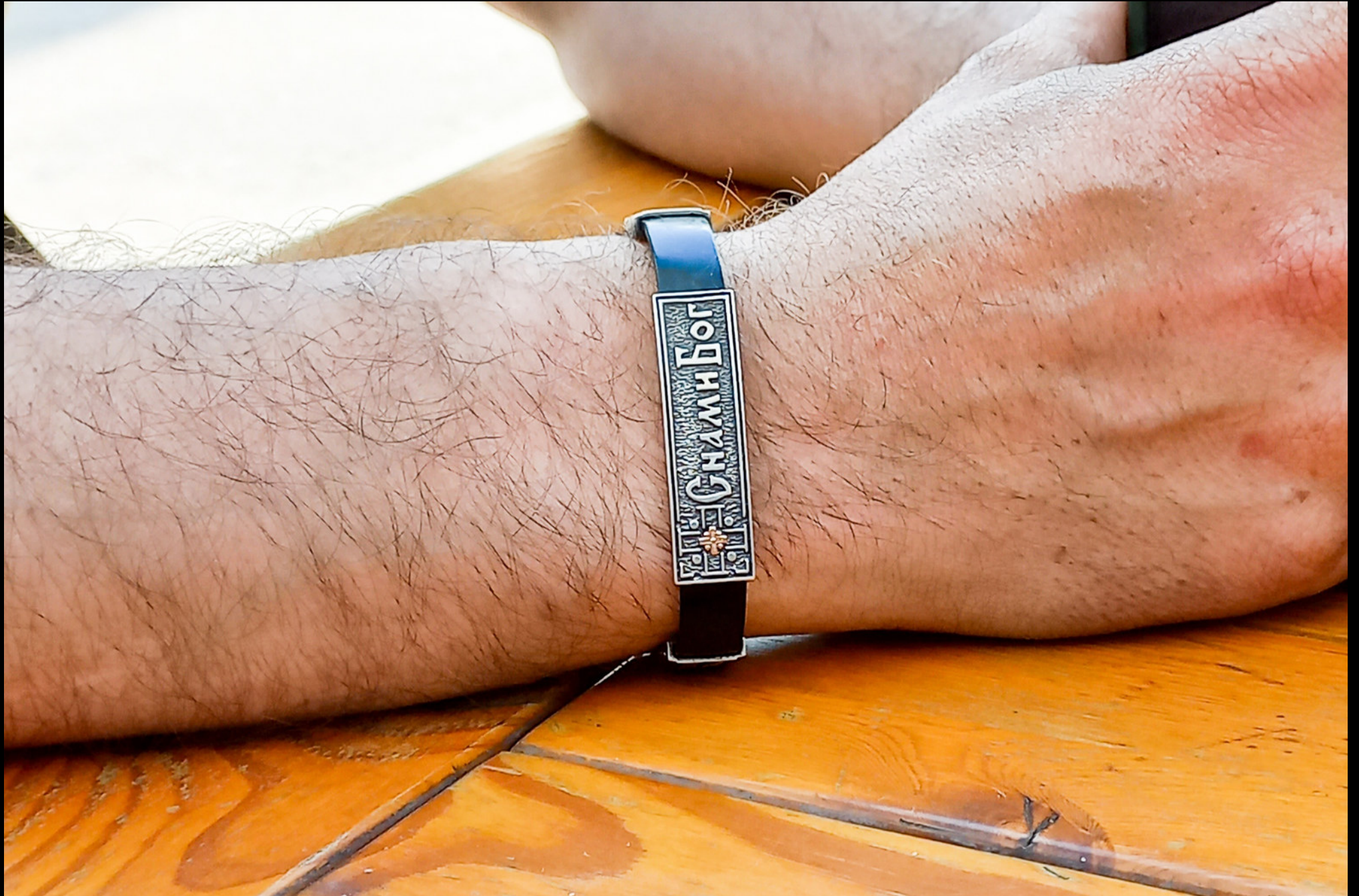
Donbas area - A bracelet being worn by a soldier with the phrase "God is with us" written on it.