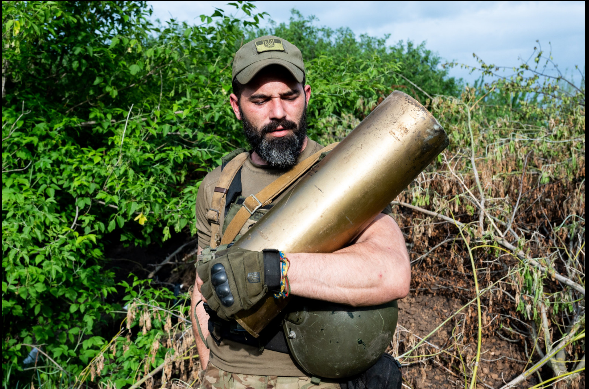
Donetsk Oblast (exact location not disclosed) - An empty 152mm howitzer shell after it had been fired.