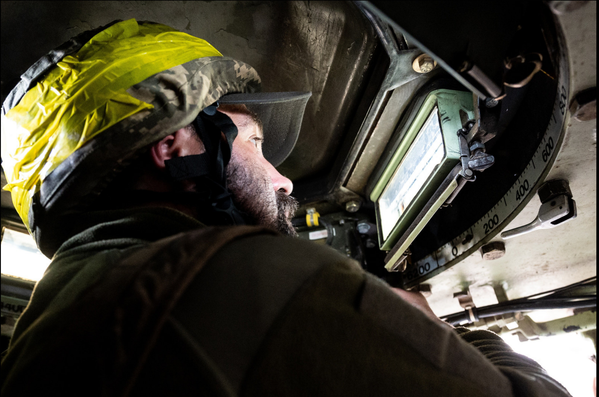
Donetsk Oblast (exact location not disclosed) - The commander, driver and passengers get to look out via very small and thick slit windows.