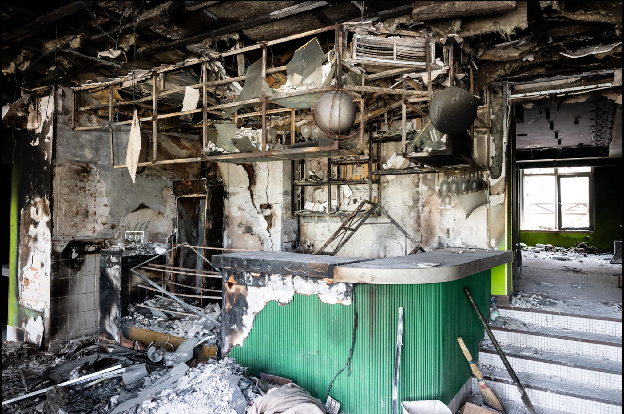
Irpín (note that the wine glasses seemed to have survived intact)