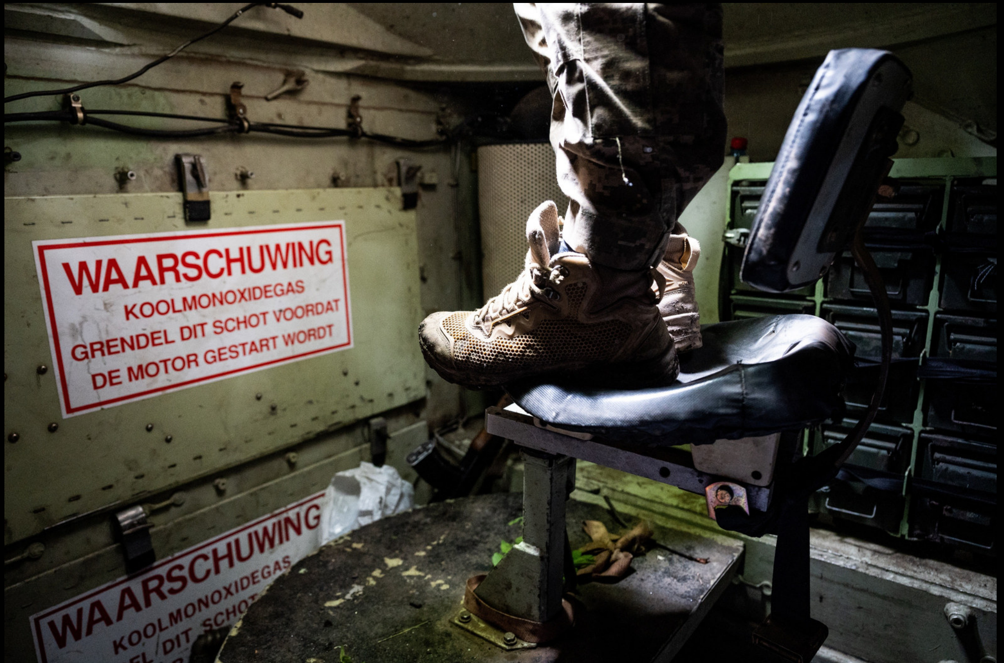
Donetsk Oblast (exact location not disclosed) - The gunner stands on a chair in order to be high enough to see his surroundings over the top of the turret.