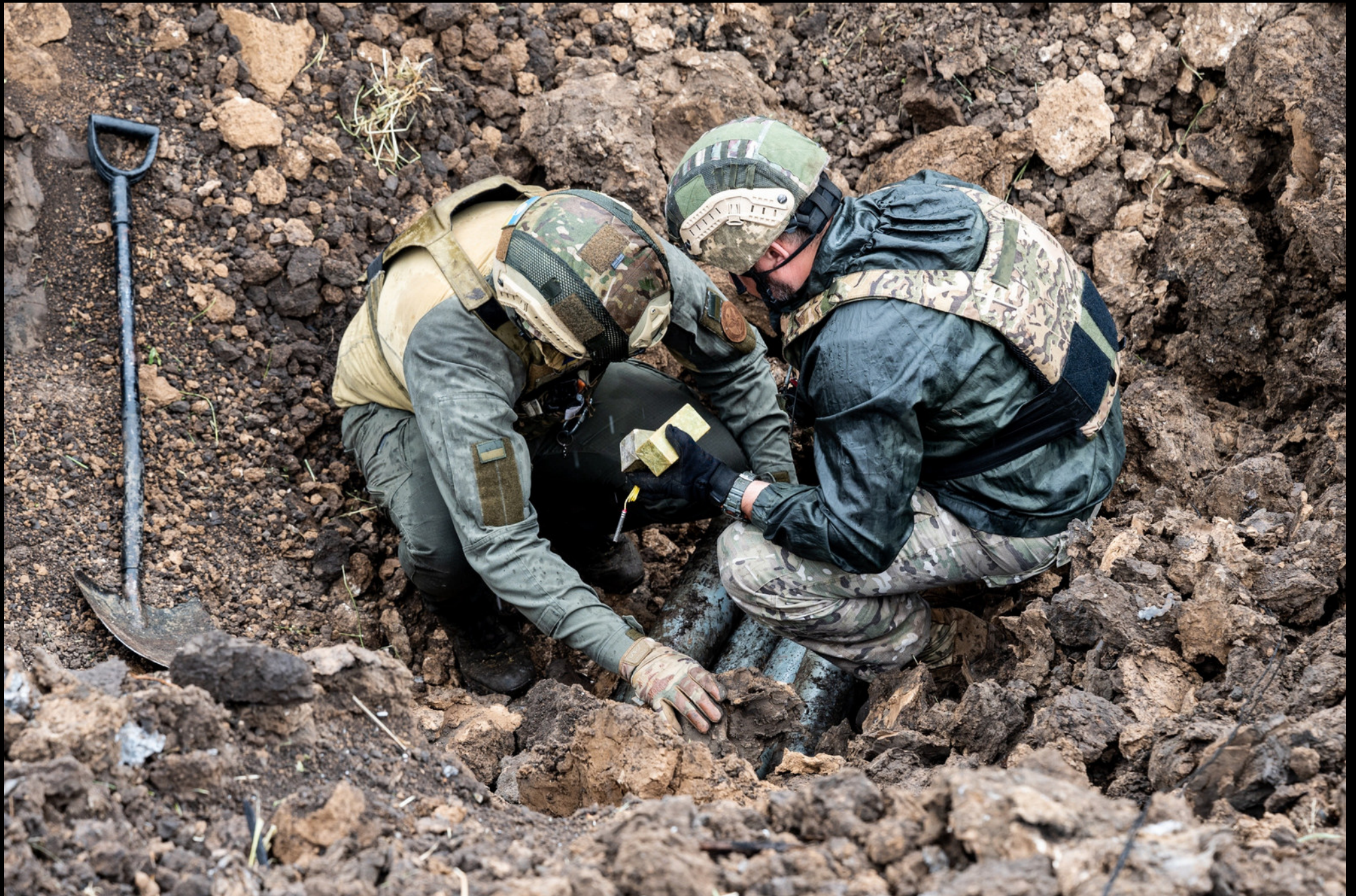
Kherson Oblast (exact location not disclosed) - Explosives (yellow bricks and a detonator) being placed with the unexploded ordinance in the pit.