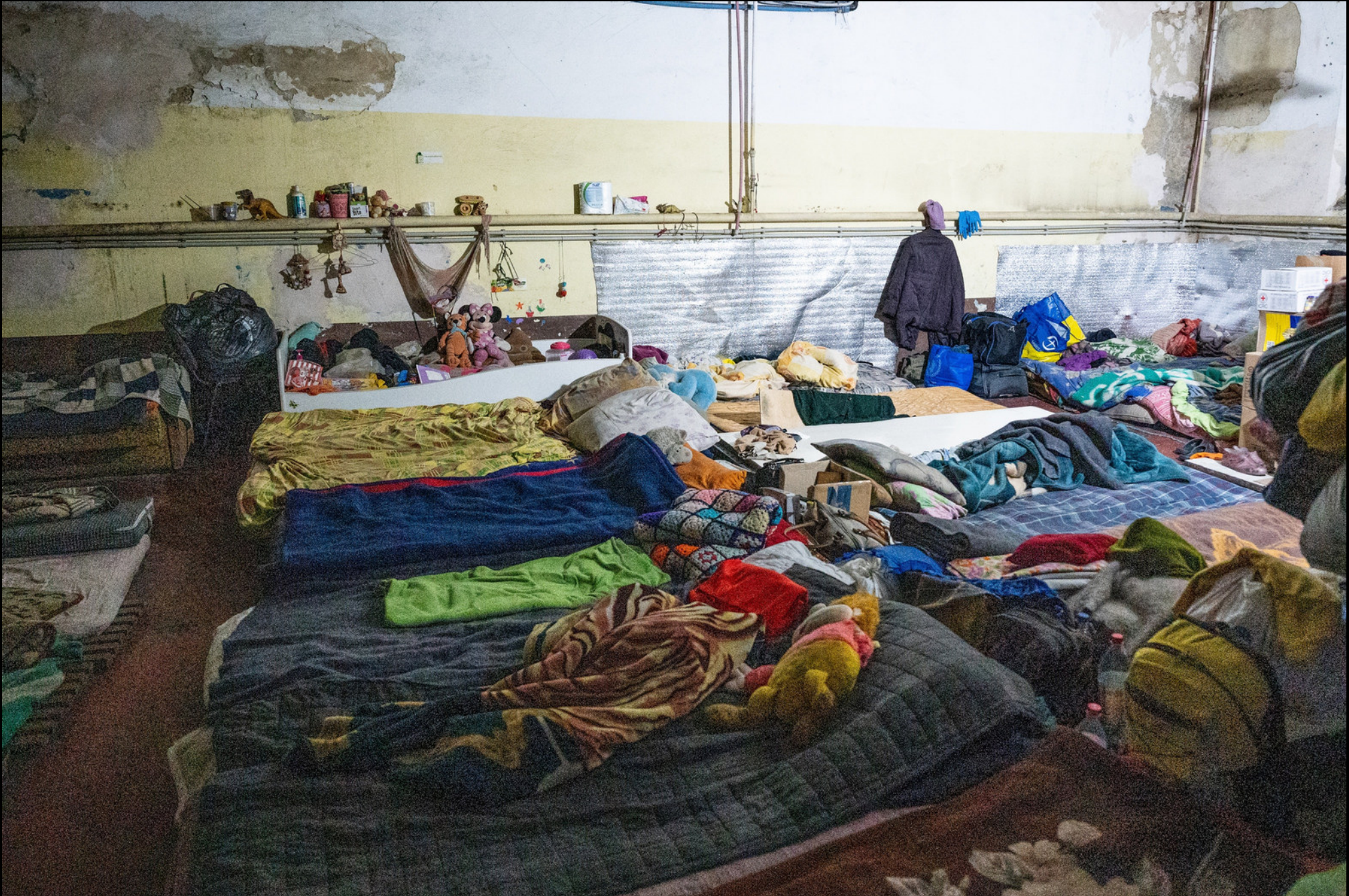
Velyka Novosilka - The basement / bomb shelter of a firehouse where people sleep.