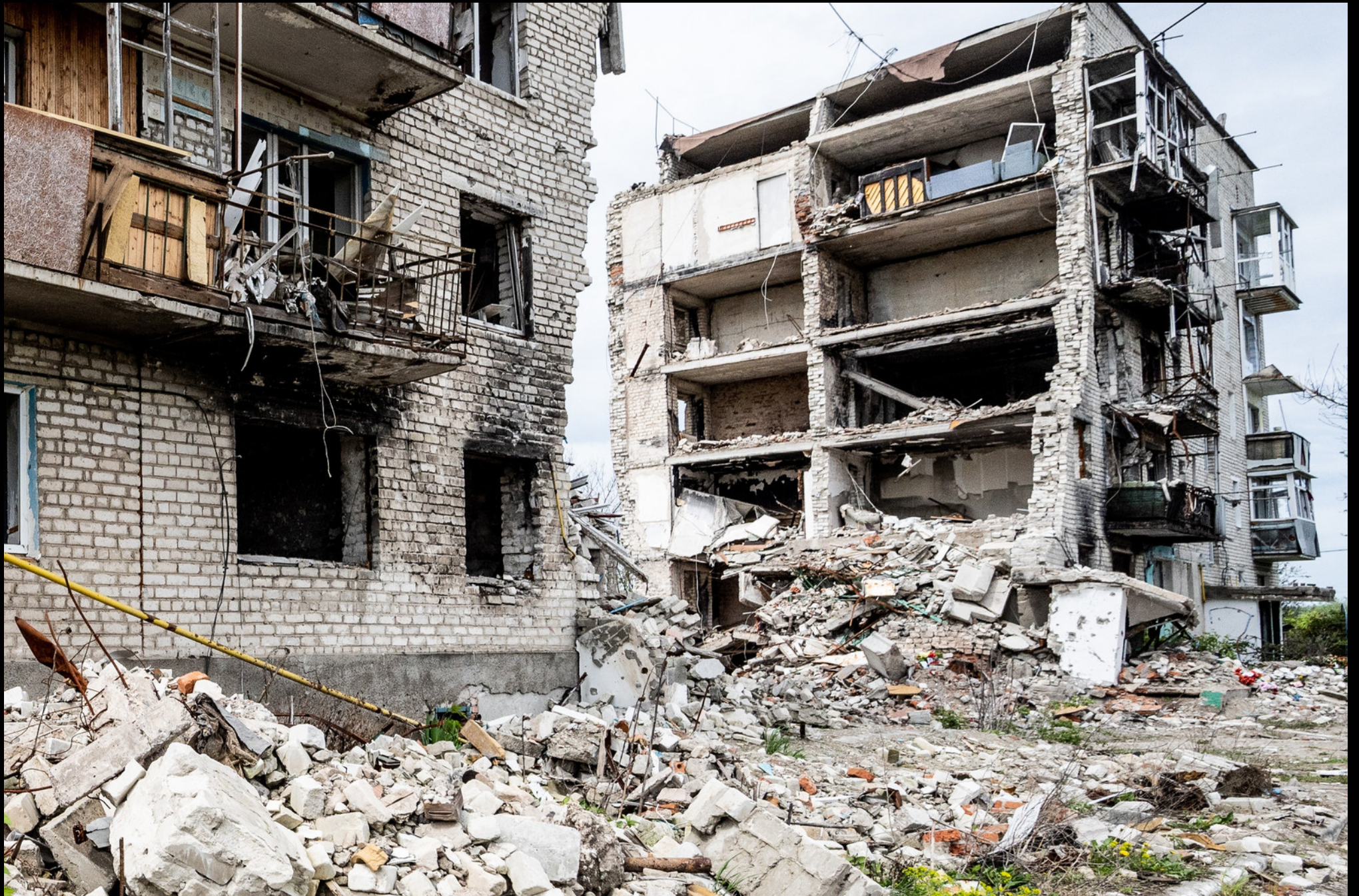
An apartment building in Izyum split in the middle.