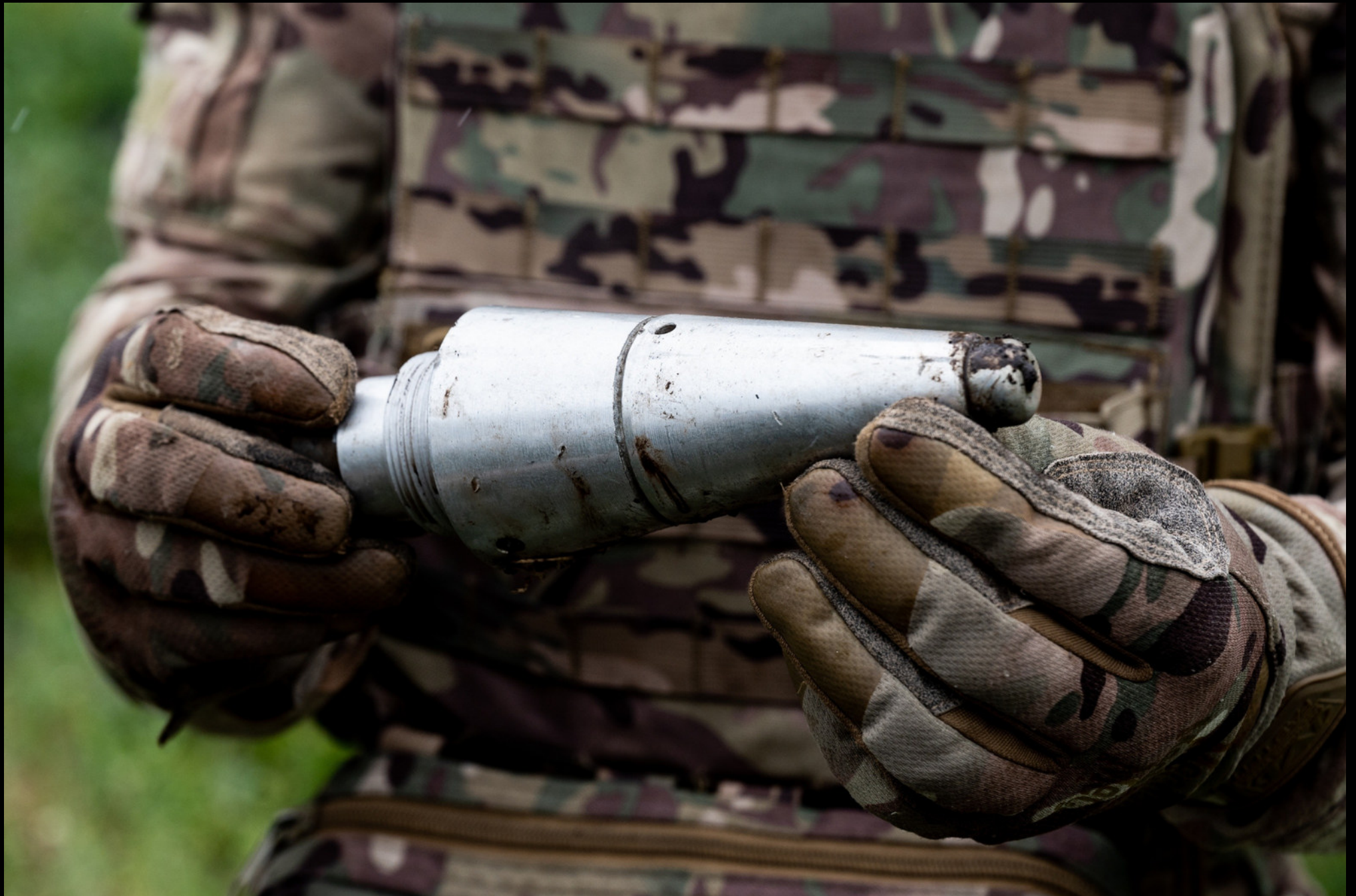
Kherson Oblast (exact location not disclosed) - The fuse from a 152mm howitzer shell after it has been removed from a live shell.