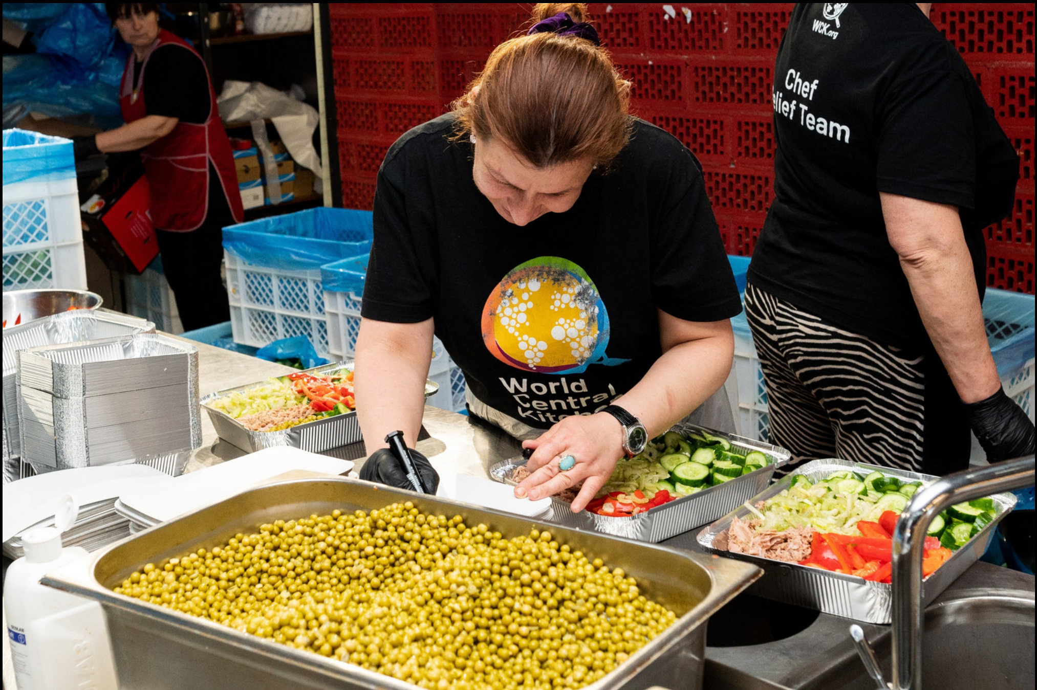
Lviv - One of many World Central Kitchens making food for distribution to those who need it.