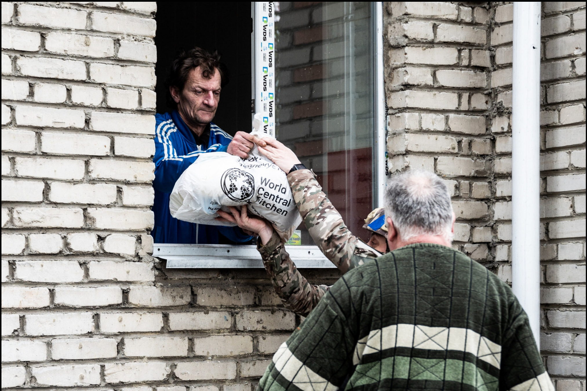
Velyka Novosilka - Delivery by special police in an uparmored civilian van of food prepared by World Central Kitchen for this frontline village.