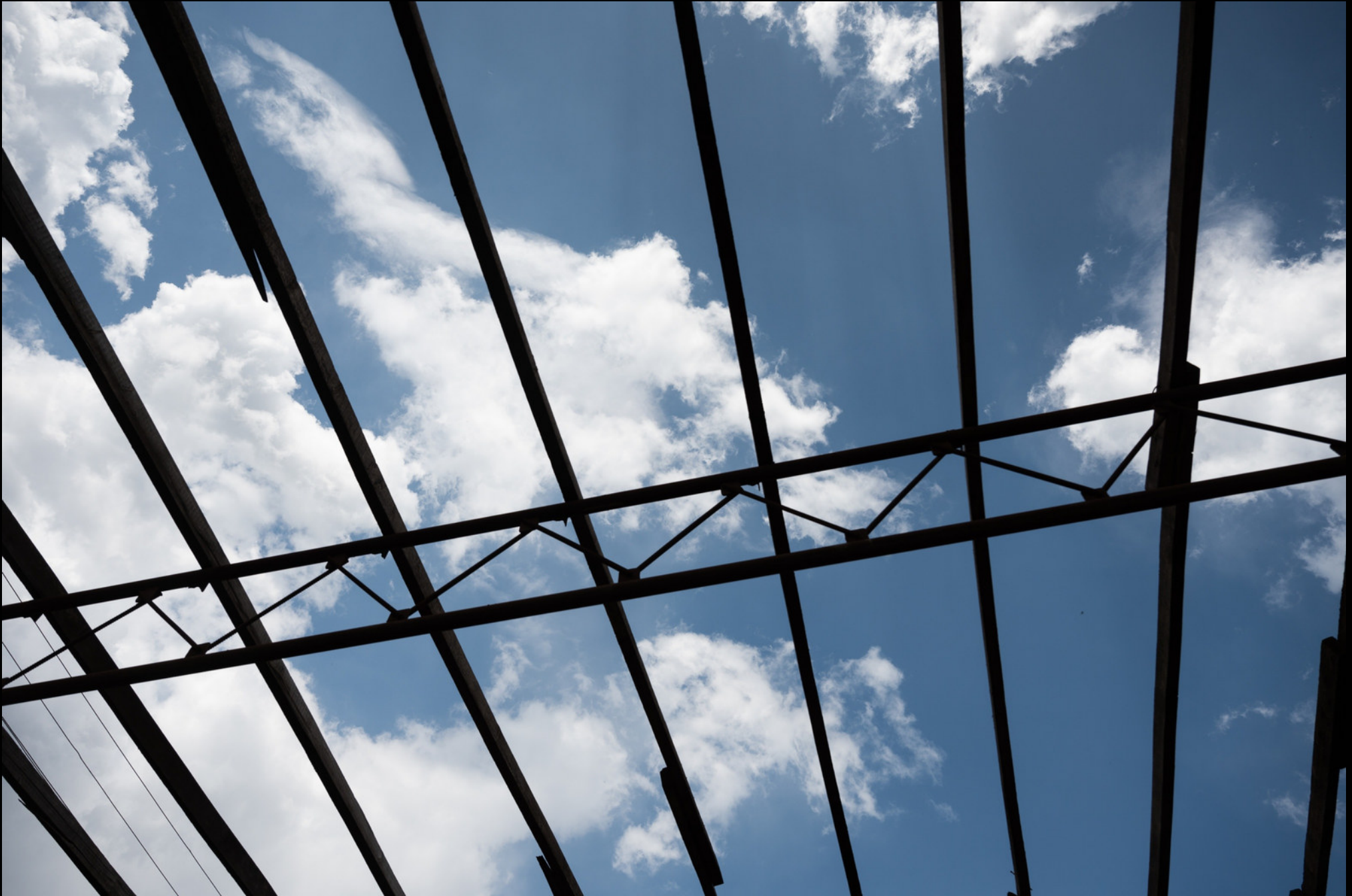
Velyka Oleksandrivka - What is left of the roof of a large building on a farm that was occupied by Russian forces and then liberated by Ukrainian forces.