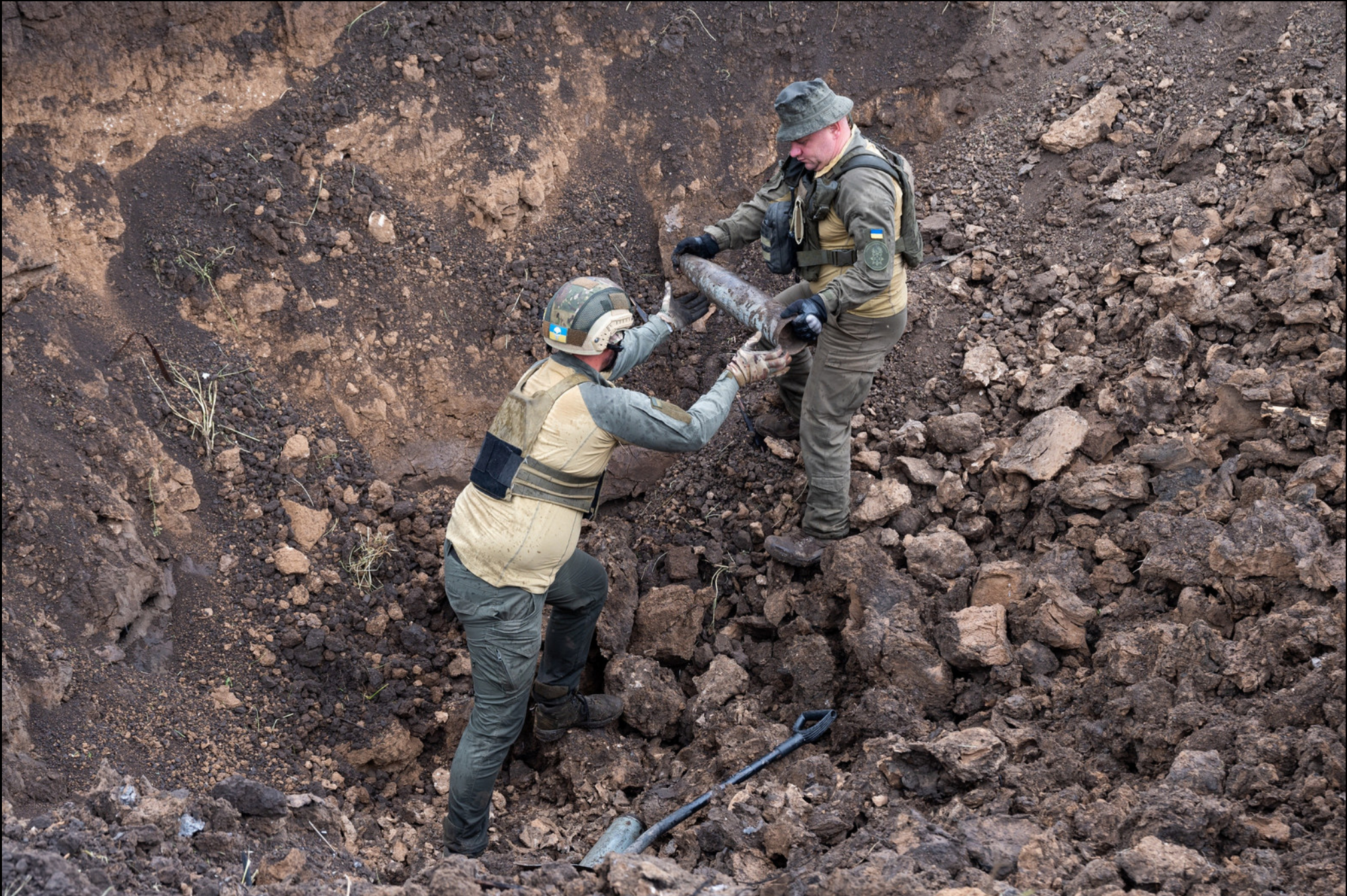
Kherson Oblast (exact location not disclosed) - Unexploded ordinance (152mm howitzer shells in this image) being placed into a pit for eventual destruction.