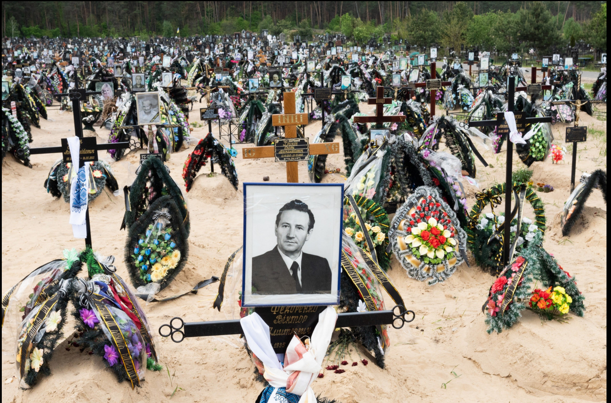
Irpin - Some markers do not have an exact date of death.