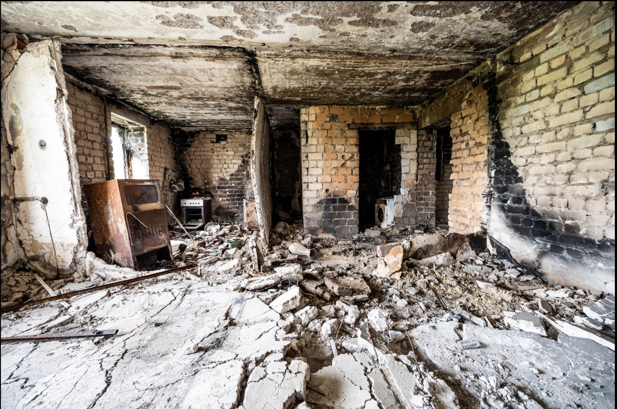
Izyum (note the unnaturally curved wall in the middle)