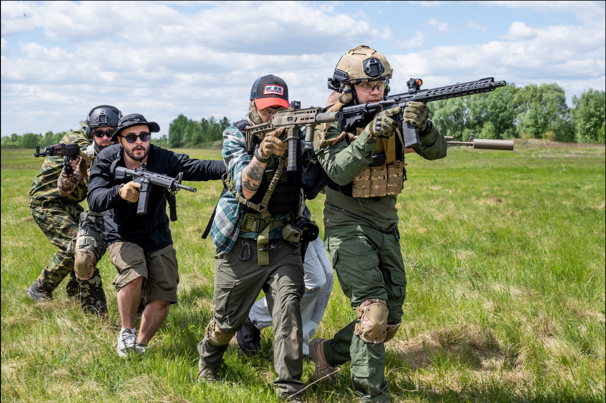
Kyiv - Civilians practicing a "stack" while training in anticipation of entering the military. The weapons are their own as the law was changed when the war started to allow civilians to own weapons such as these.