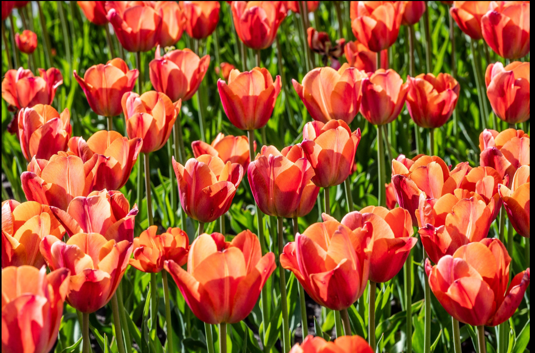
Kyiv - Tulips in Maidan Square.