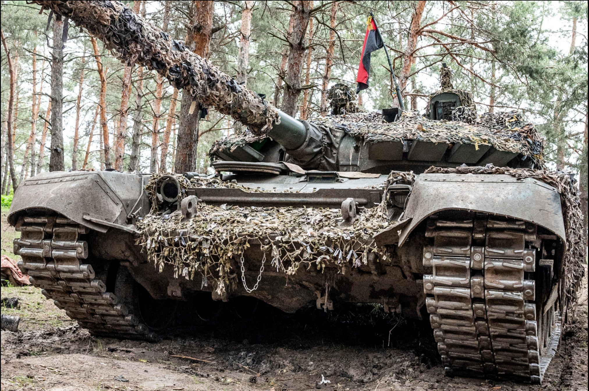
Kivsharivka - A captured Russian T-72 tank hidden in a forest along with other tanks.