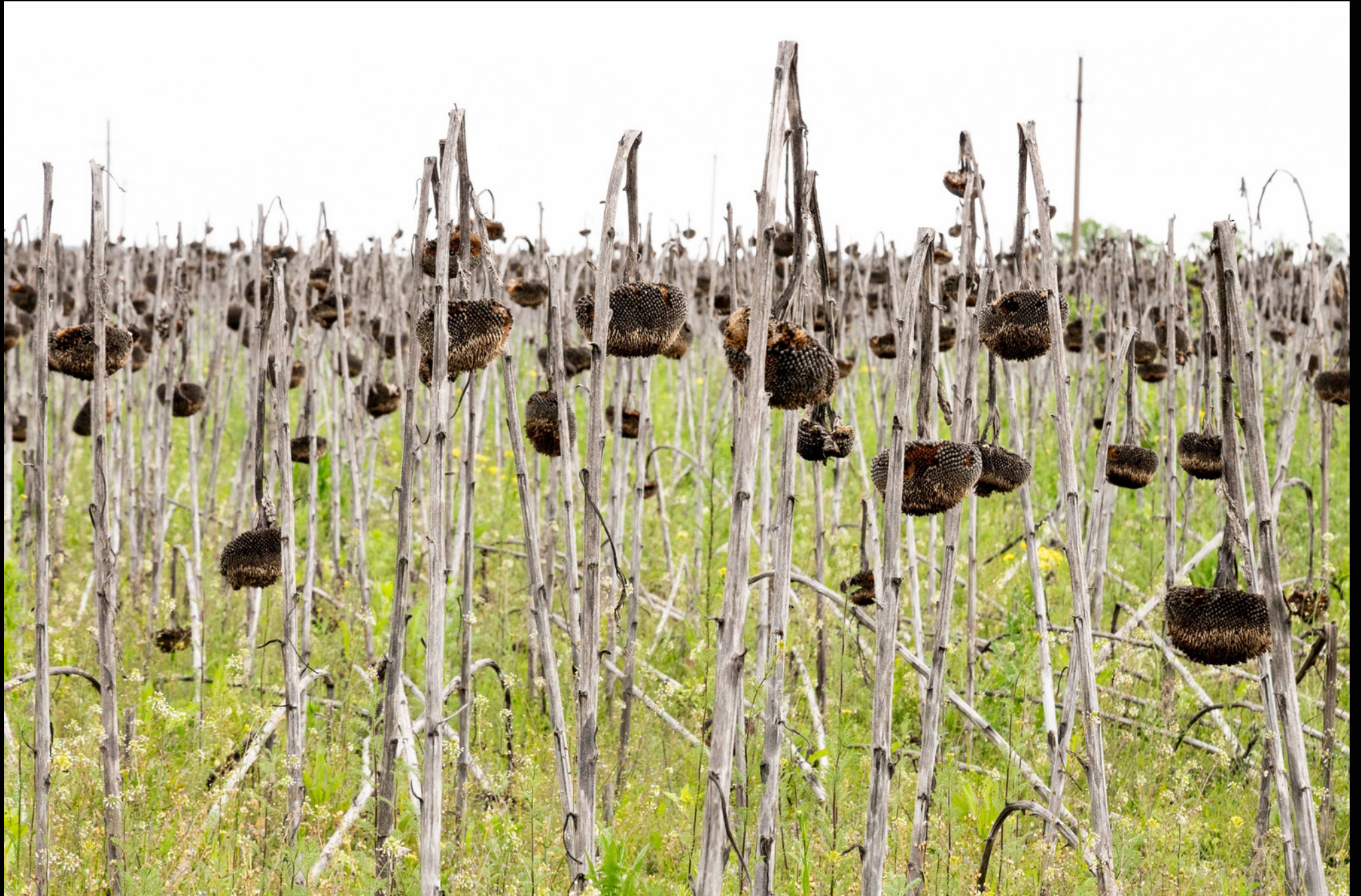
Kivsharivka - A sunflower field that was never harvested because of the war.