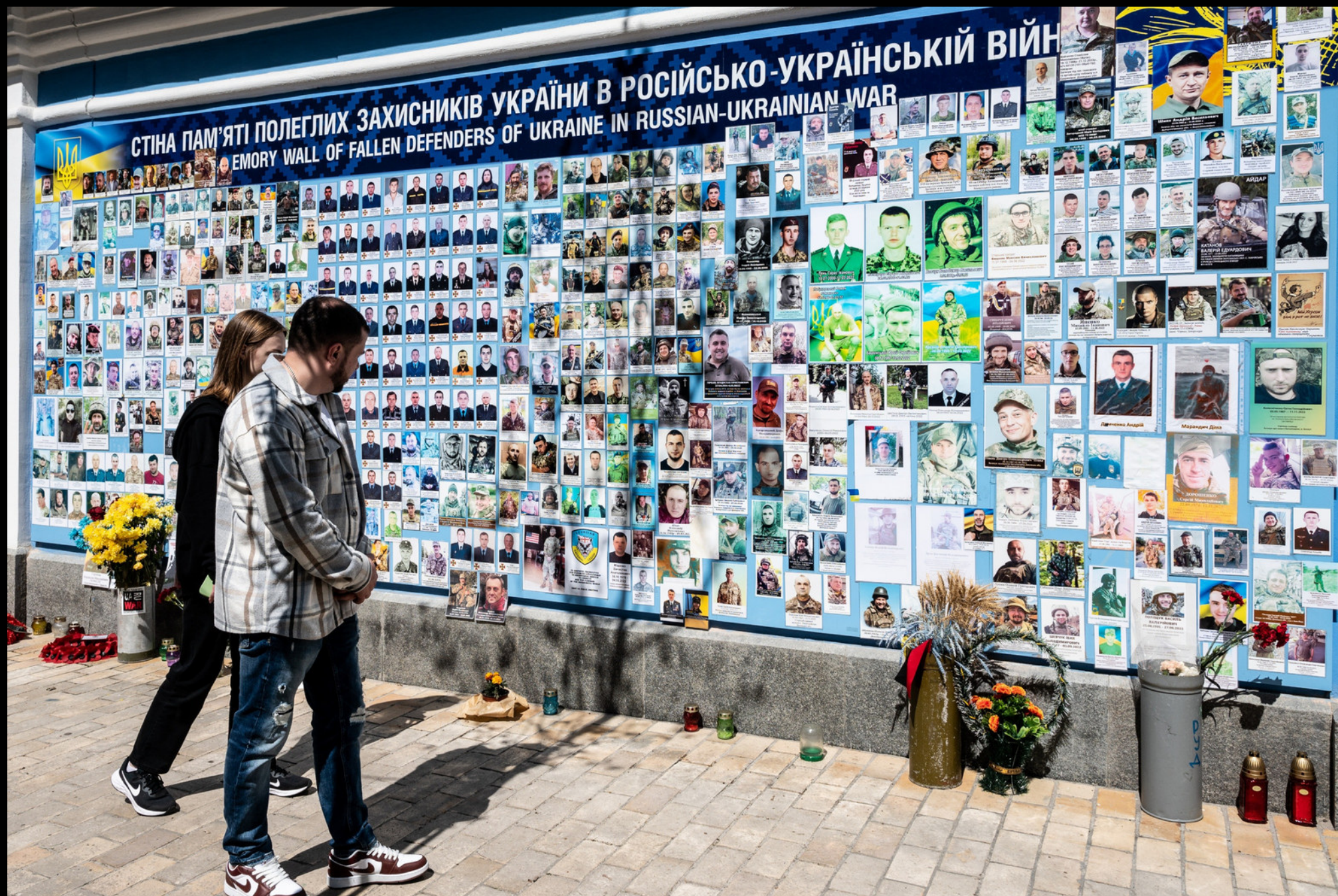
Kyiv - A memorial wall near St. Michael's for soldiers killed in the war.