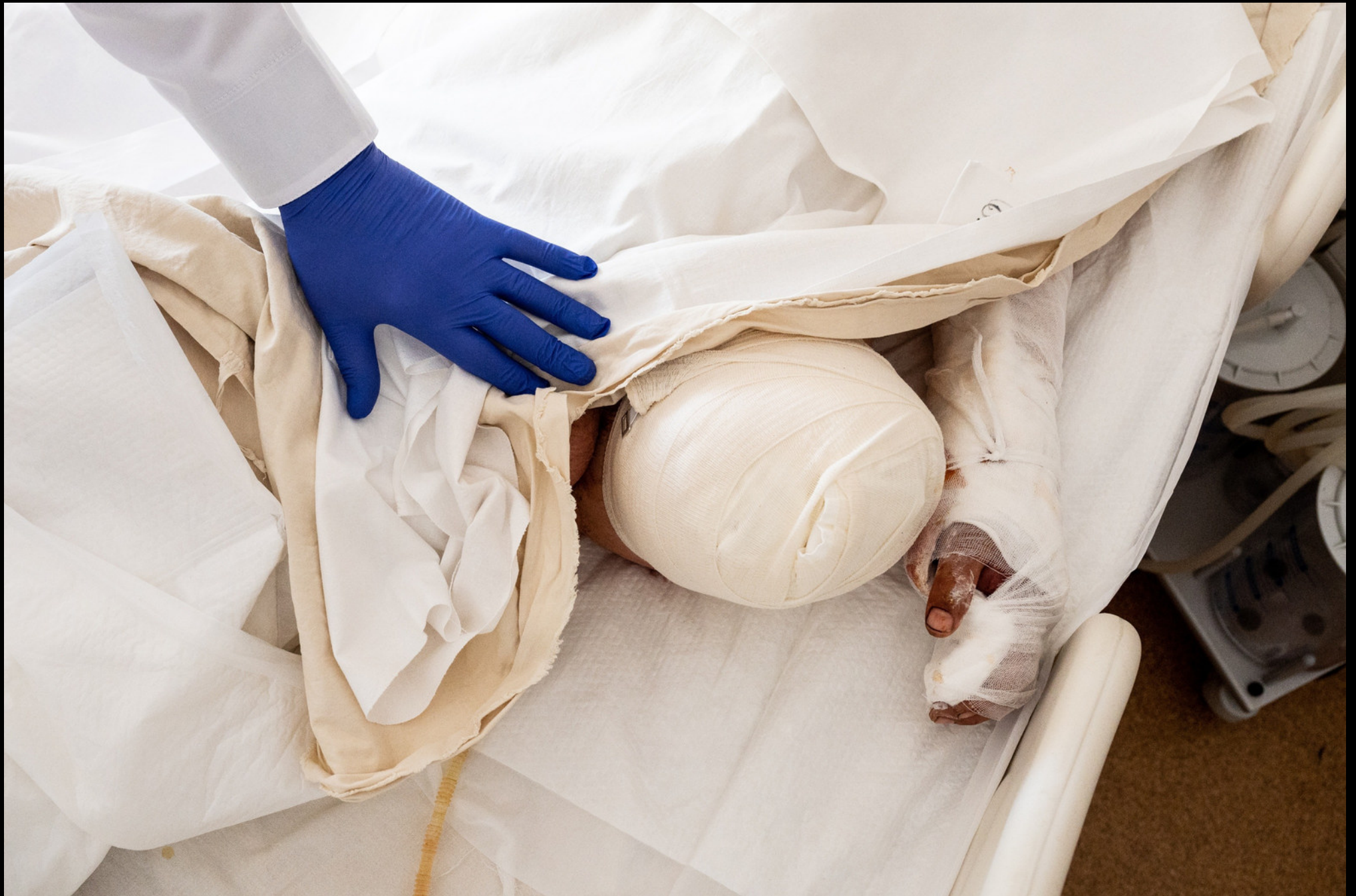
Dnipro - As well as his left leg.