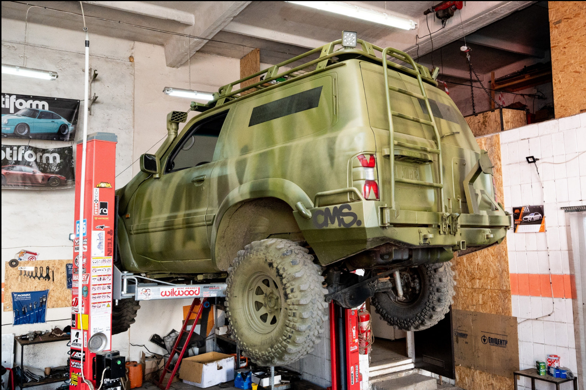
Kyiv - One of many vehicles donated from across the world to Ukraine. They are painted some shade of green before they are put into use by the military.