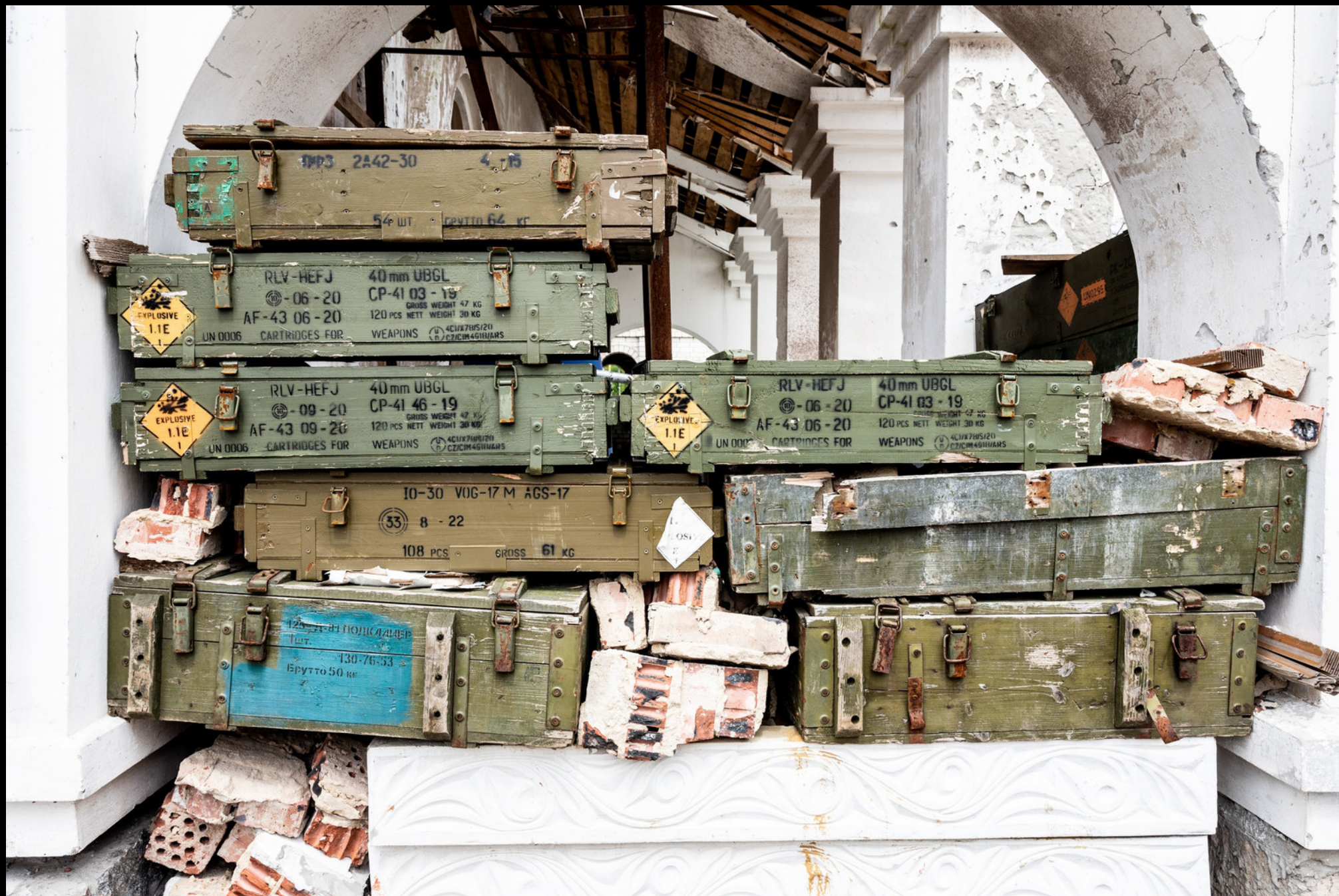
Dolyna - Empty ammunition cases left by Ukrainian forces at a destroyed monastery. (40mm UBGL - 40mm Under Barrel Grenade Launcher)