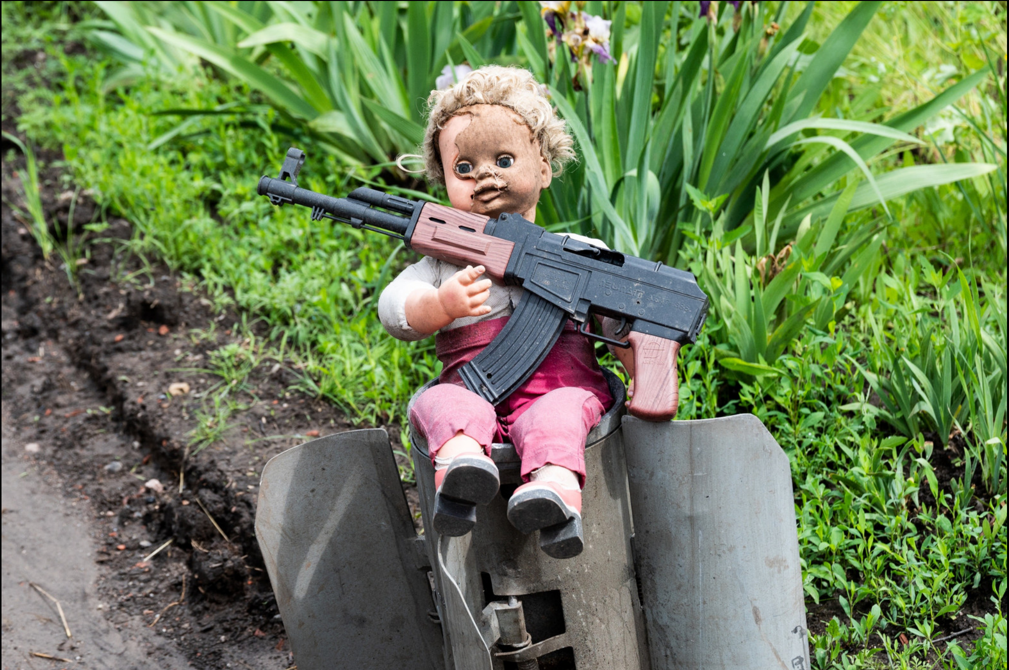
Donetsk Oblast - A doll with a toy military rifle sitting on the tail section of a (real) rocket.