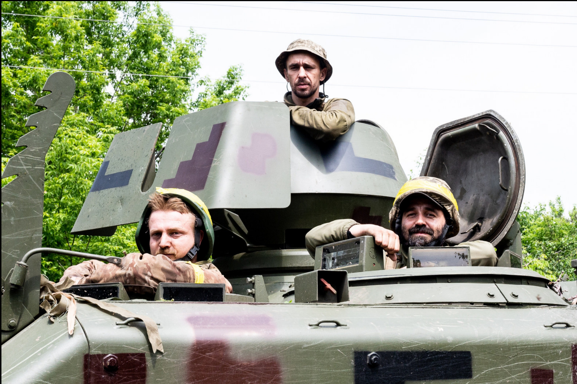
Donetsk Oblast (exact location not disclosed) - The mortar is actually located in a different place and to get there we are transported in an armored personnel carrier (YPR-765). Shown here are the driver (left), commander (right) and gunner (top).