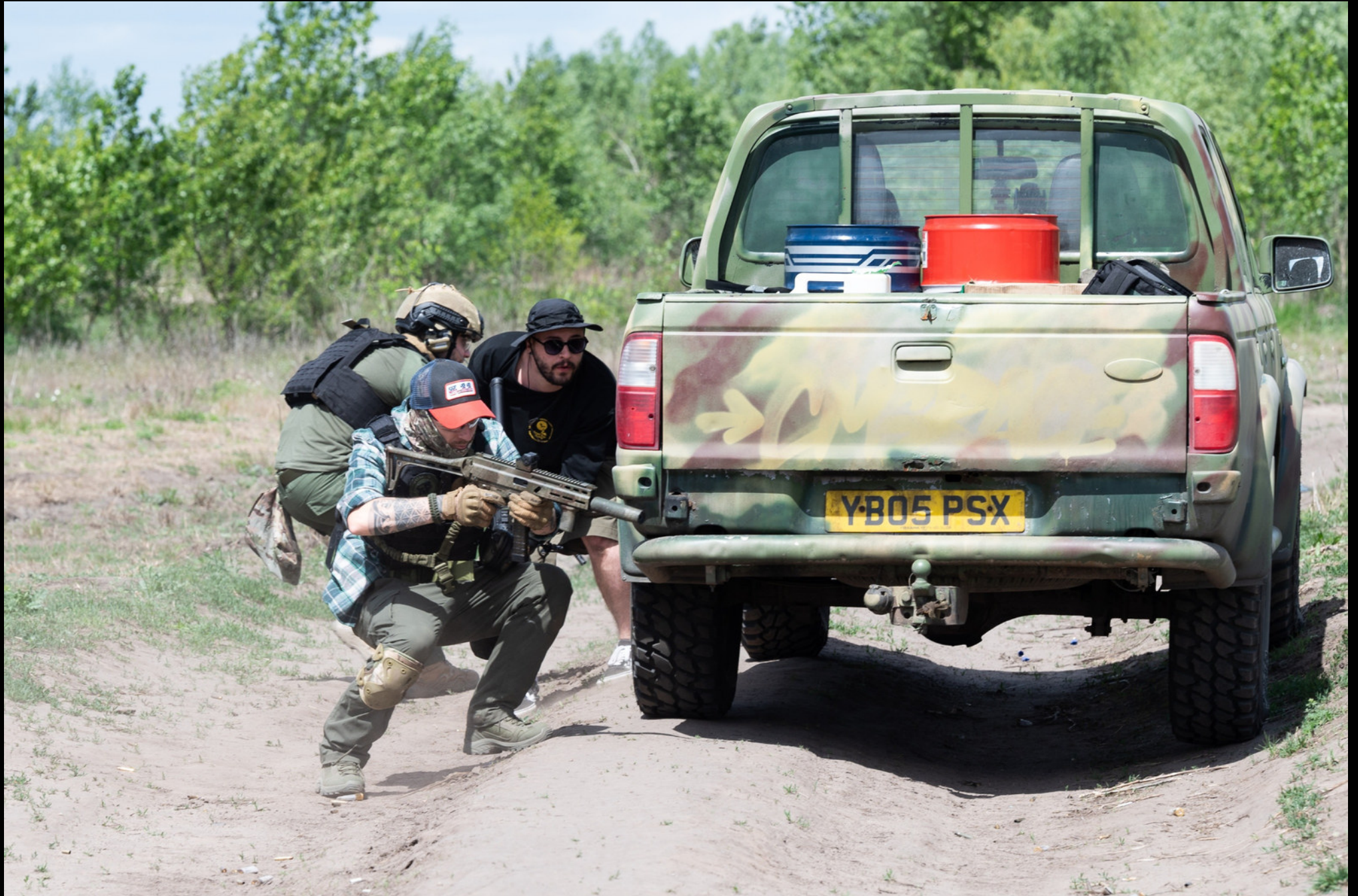
Kyiv - Learning how to approach and safely use a vehicle as a shield.