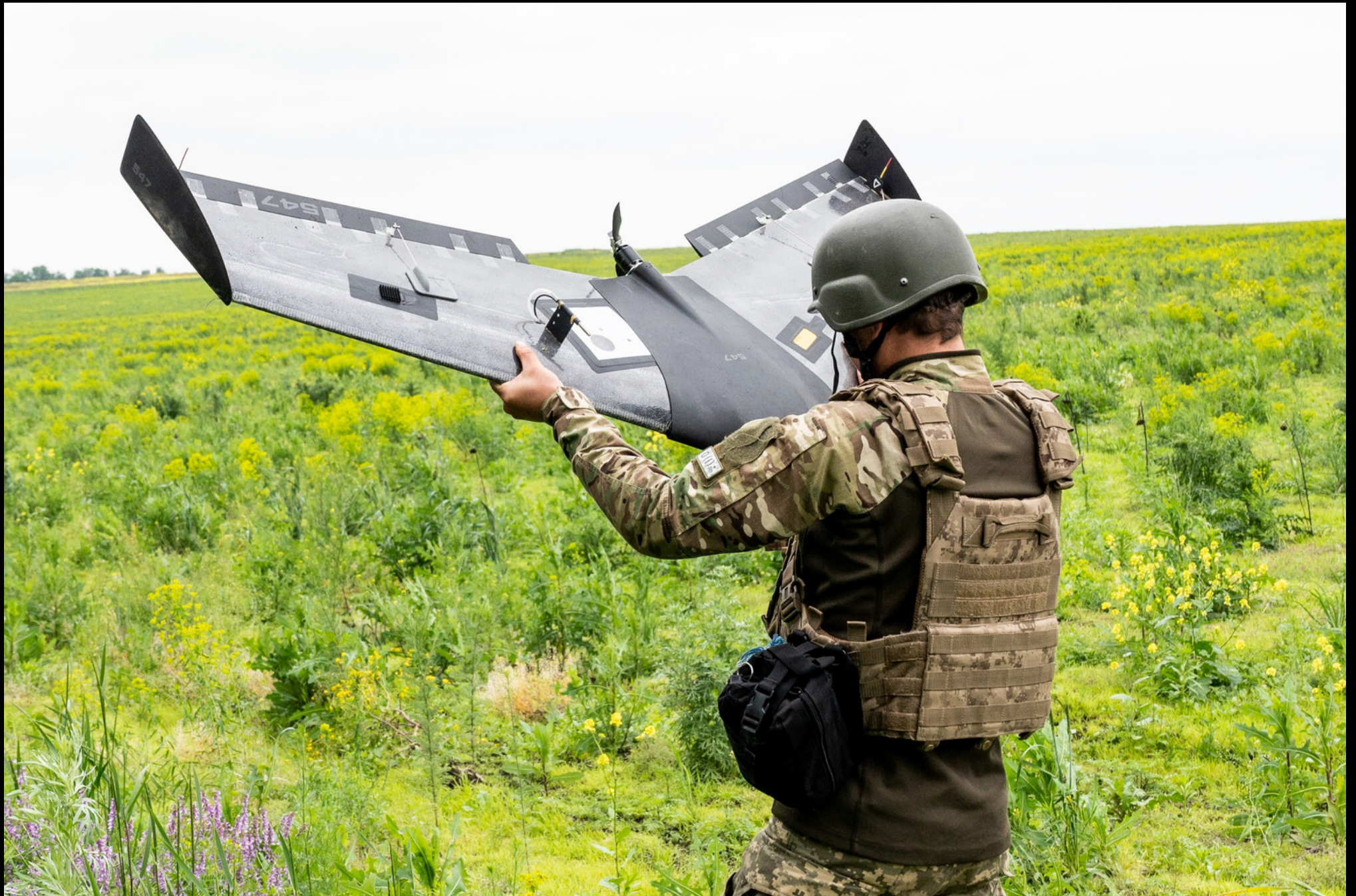
Donetsk Oblast (about 6 km from the front, exact location not disclosed) - The Ukrainian made Valkyrja drone is carried out to a field in order to launch it.