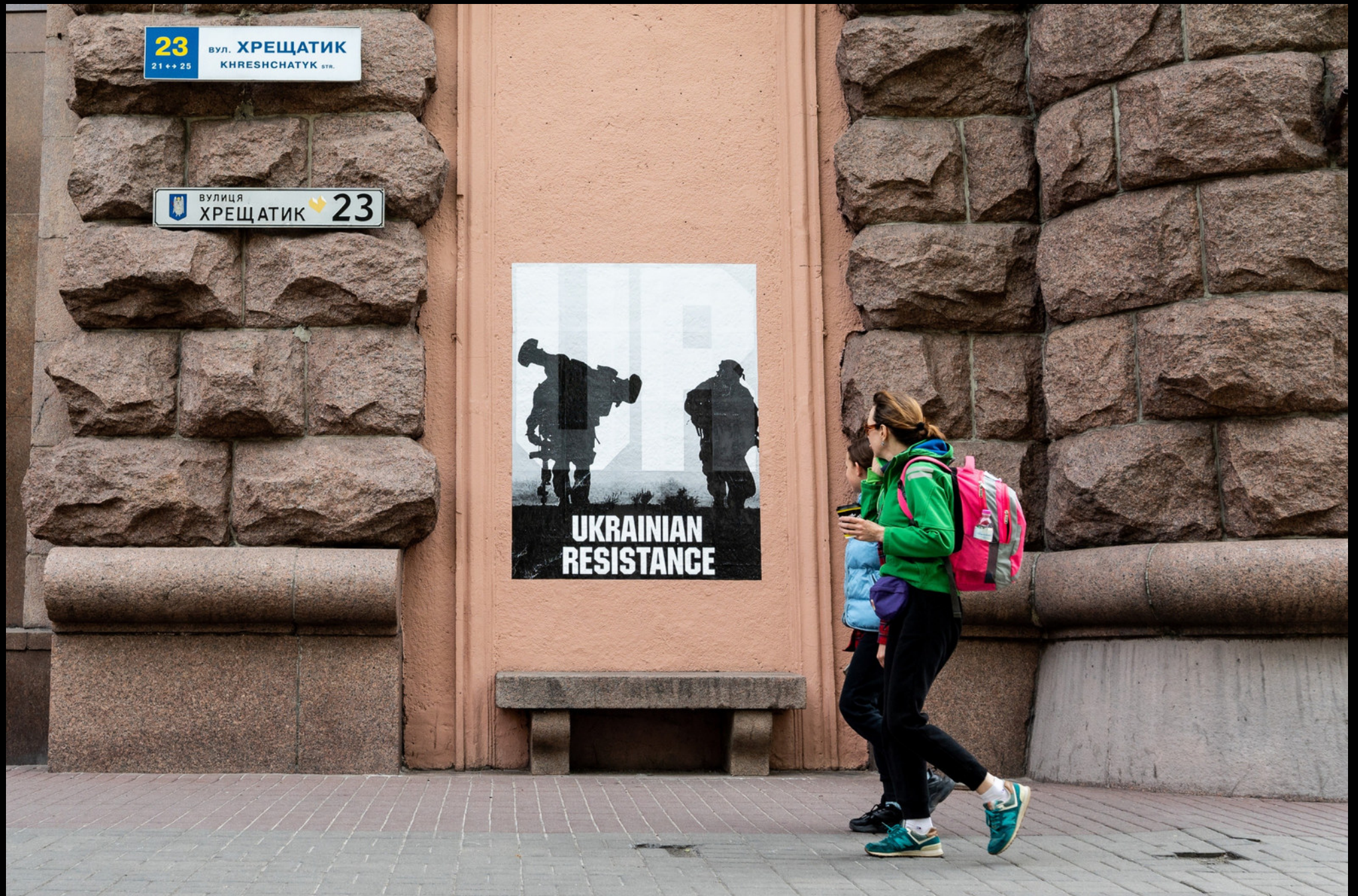
Kyiv - Patriotic posters like this were posted around Kyiv with their images changed periodically.