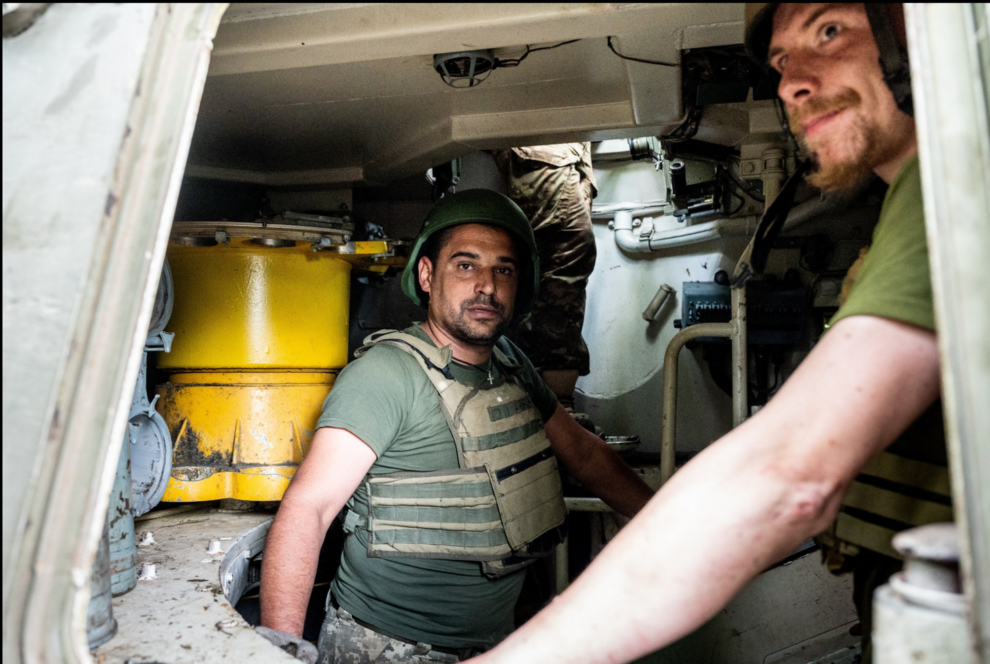
Donetsk Oblast (exact location not disclosed) - The inside of a self-propelled 152mm howitzer.