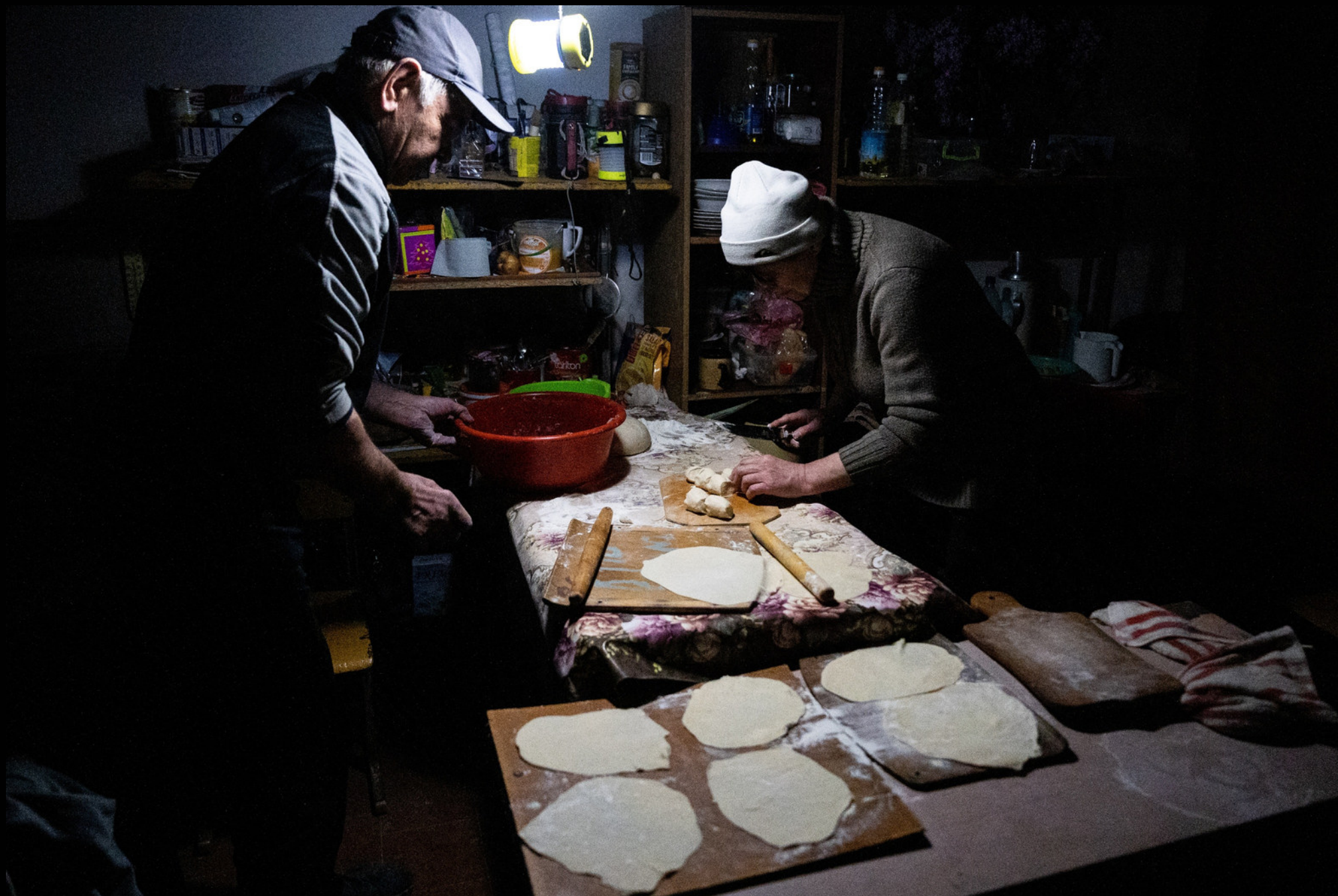
Rozdolne - A makeshift kitchen in the basement of a school.