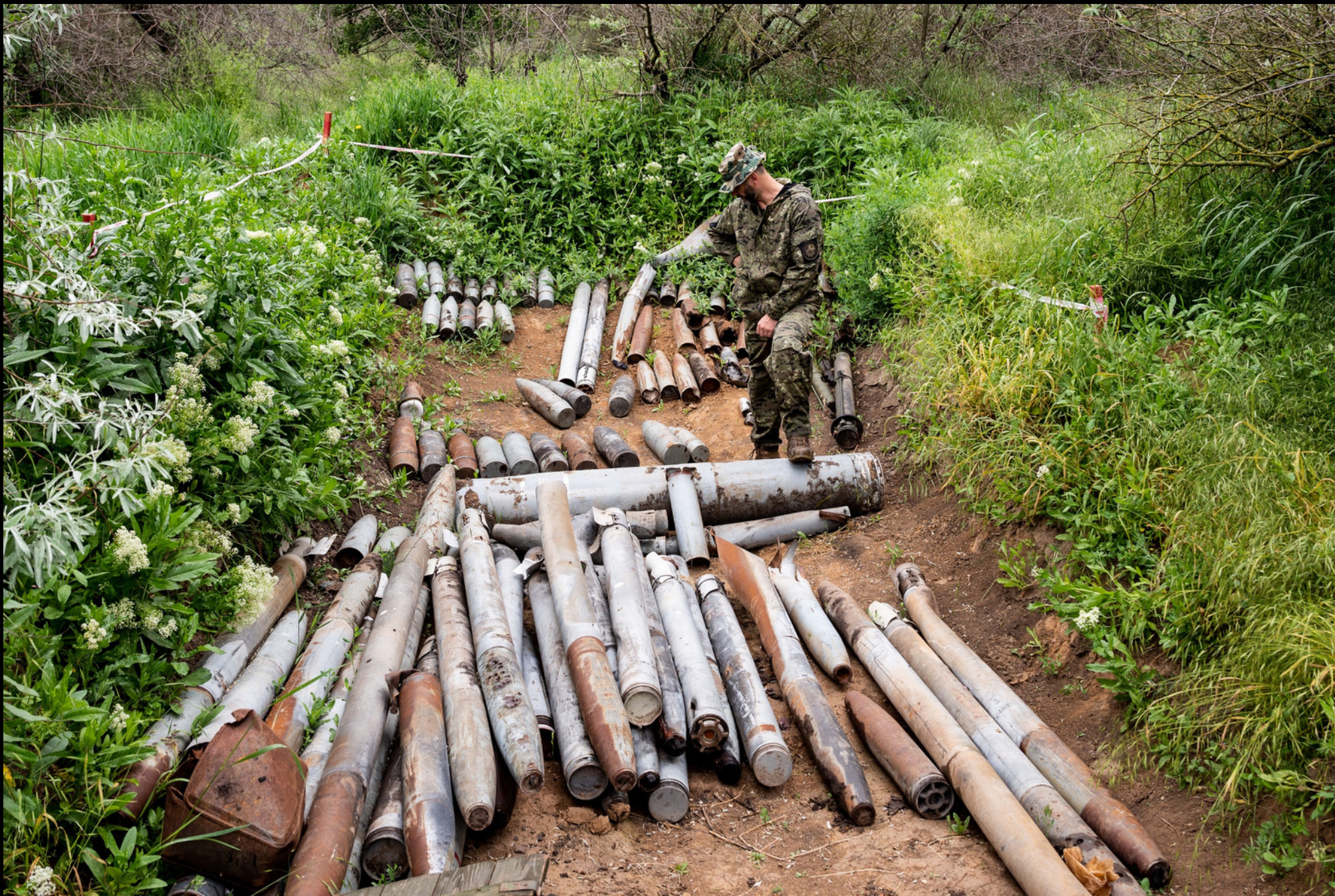
Kherson Oblast (exact location not disclosed) - A collection of unexploded ordinance for eventual destruction by a demining unit.