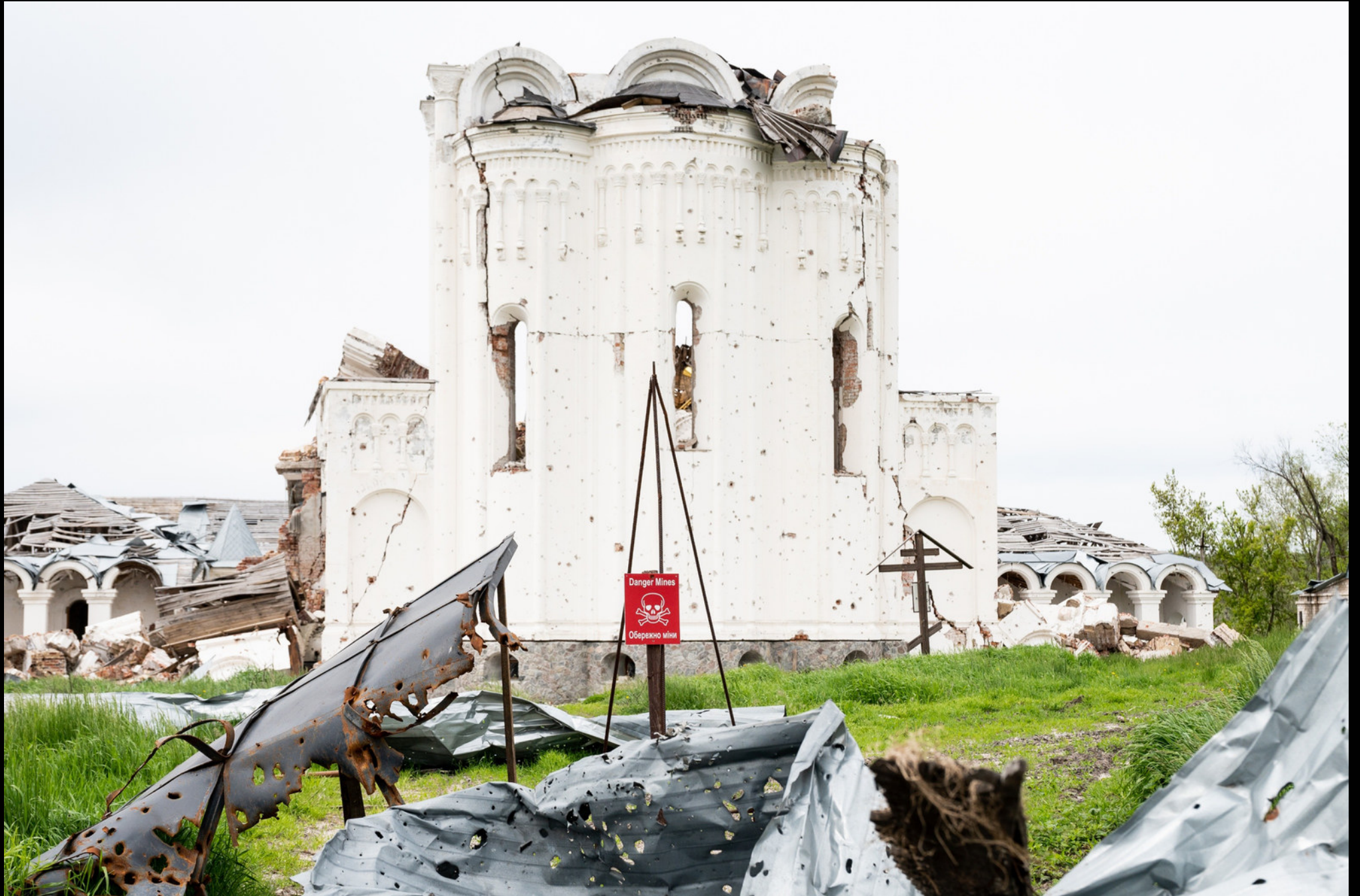
Dolyna - A sign warning for landmines at a monastery destroyed during the war.