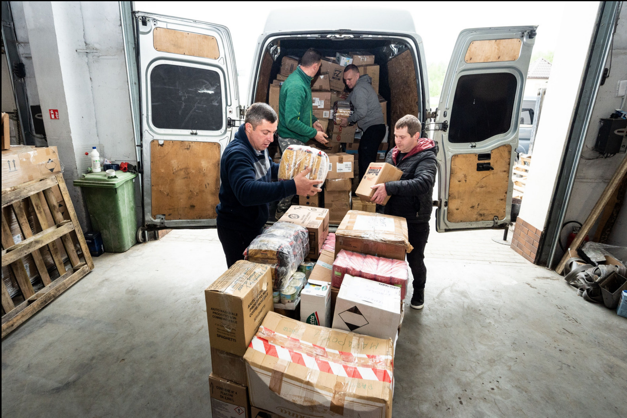
Near Lviv (undisclosed location) - Unloading donated good into a warehouse for distribution throughout Ukraine.