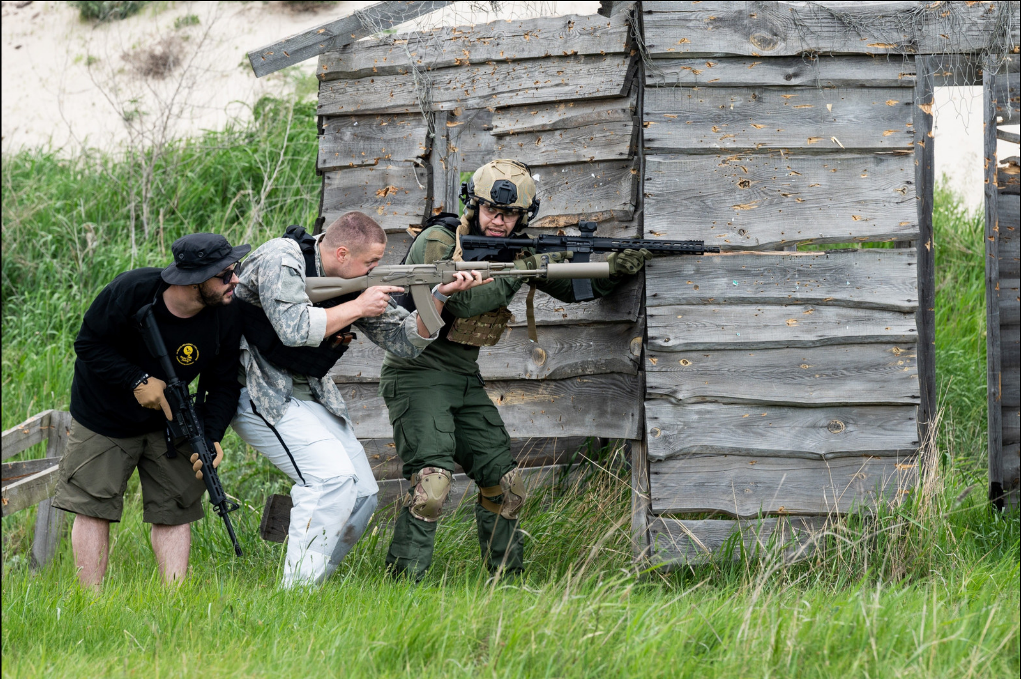
Kyiv - Learning how to approach and attack a building.