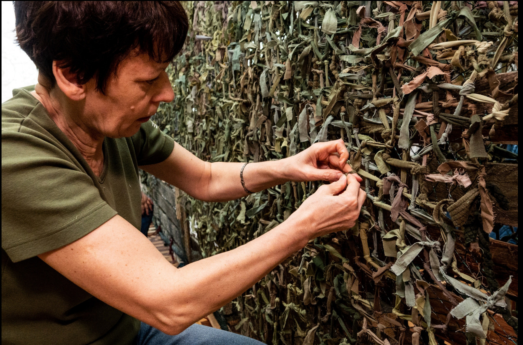
Lviv - Making a camouflage net in a spare room in a library.