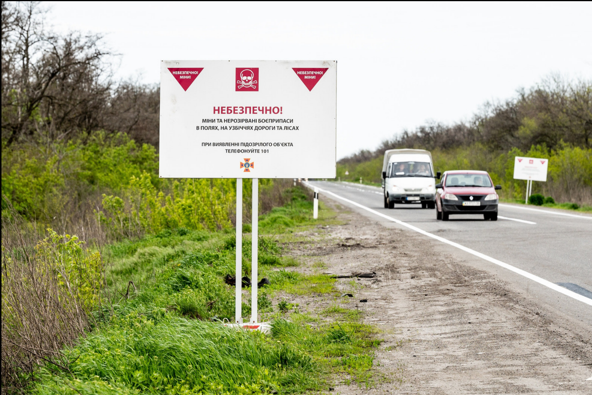
Mykhailivka - One of many signs warning of landmines.